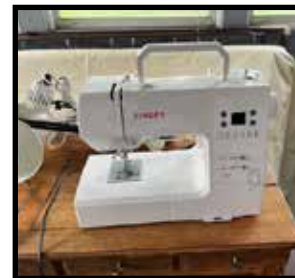
Singer sewing machine #7444, nice