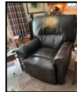
Power lift chair