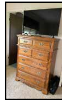
Queen modern oak 4-piece bedroom set; bed complete, dresser, chest & nightstand; like new

NOTE: Due to the law on lead-based paint & lead based paint hazards on any home built prior to 1978, any inspections for lead base paint by a purchaser must be done 10 days prior to the auction. Buyers will be given an EPA pamphlet & will be required to sign a disclosure acknowledging that you were given the information.