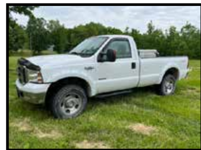
2007 Ford F-350 XLT Super Duty Power Stroke Diesel V-8; 4x4, single cab, 4 speed, white, second owner, only 113, XXX miles