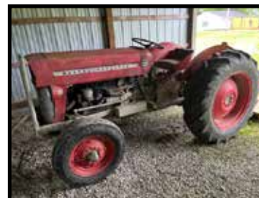
Massey Ferguson 135 gas tractor; 12-volt power steering, wide front end, shows 2,800 hrs., good tractor