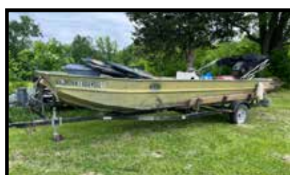
1987 19' Polar Kraft semi-v wide bottom w/ 60 hp Mercury outboard motor & Haul Rite trailer w/title for boat & trailer