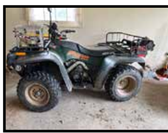
1997 Artic Cat Bear Cat 454; 4x4,4-wheeler, bought new

- 2004 Honda 250 Recon ES all terrain 4-wheeler