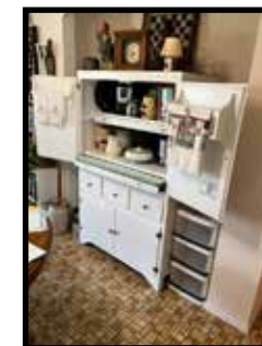
1950's white kitchen cabinet w/ porcelain tray