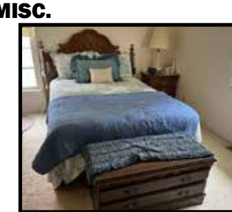
1970's 3-piece queen bedroom set; bed complete, dresser w/ mirror & chest