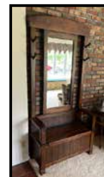
Hall tree bench type, nice