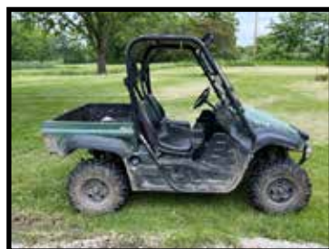
2006 Rhino 660 Yamaha w/extra seat