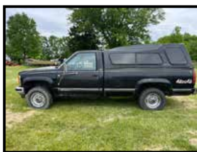
1990 Chevy Silverado 2500; 4-wheel drive, 350 turbo trans. w/ camper shell, bought new, 106, XXX miles, good truck