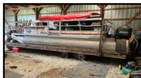
1981 Kayot 24' pontoon aluminum w/1987 90 hp Mercury outboard motor, ran when stored in shed