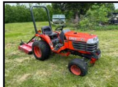
Kubota B 7300 HST 4-wheel drive; 3-cylinder diesel, 3pt w/ PTO, only 851hrs. w/ 60" mower deck