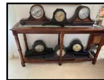
10 Ingraham, Sessions, Seth Thomas, shelf clocks