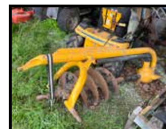
3pt Danhuser post hole digger w/ 18" auger, like new