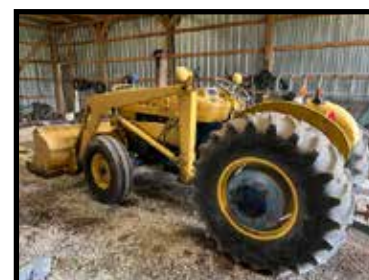
Ford 4400 Industrial tractor; gas, 3pt, wide front, good rubber, sells w/industrial hydraulic front end loader, shows 4,480 hrs., good outfit