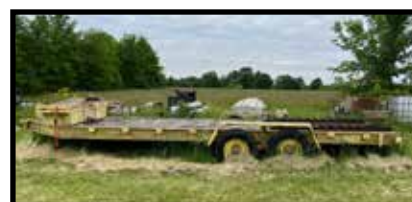
1992 20' tandem axle H/D float type trailer w/ ramp & ball hitch