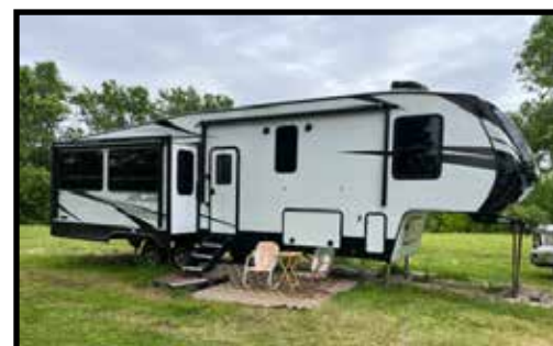
2021 ATLA 5th wheel travel trailer; 36' w/ king bedroom, 3 bump outs, roll out power awnings, bought new June of 2021, pulled from dealer to farm only, cost over $68,000 new, same as new, sells with Recon Demco 5th wheel hitch