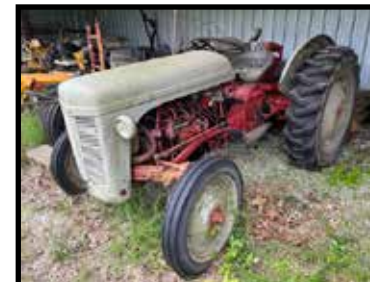
8 N Ford complete (needs wiring)