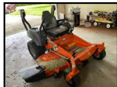
2021 Husqvarna MZ61 Zero-Turn 24 hp, 61" cut, bought new, only 103 hrs.