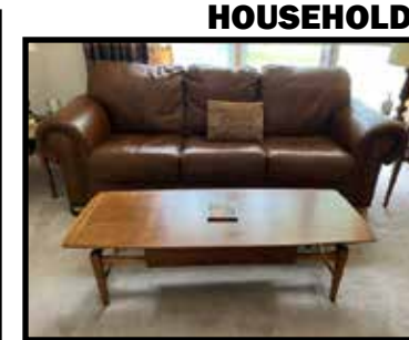
Over size 2-piece brown leather sofa & loveseat, nice