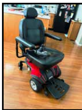
Jazzy Select Elite Power handicap scooter, runs, nice