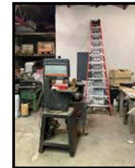
Craftsman 12" bandsaw, sander, floor model