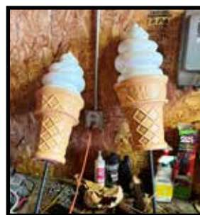
Safe-T cup ice cream cone advertising