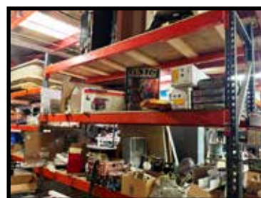
Lot 8' & 10' pallet shelving

SELLS FROM AUCTION BARN BUYER TO PICK UP AT 1227 N 2ND ST., ST. CHARLES, MO