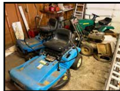
2 Dixon ZTR 3303 Zero-Turn, 10.5 hp riding lawn mowers