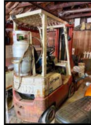
Datsun 2000 LP tow motor