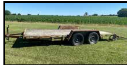
Midwest 16' tandem axle trailer w/ drop ramps & 2 5/16 ball