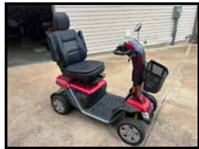
Pride Pursuit XL handicap scooter (outdoor) runs, nice