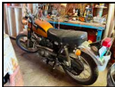
1972 Honda 350 motorcycle, shows 3,XXX miles