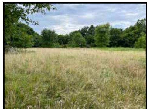
Lot 26 Crossroads Estates approx. 3 acres m/l fronting on Hwy W.

Improvements include a 3-bedroom ranch home built in 2006 w/ 2 ½ baths, approx. 1,557 sqft living space with open floor plan, including living room with fireplace, dining room & kitchen and main floor laundry. Full walkout basement (finished) w/ 3 bedrooms (2 have no windows), family room, full bath & 2nd laundry room. The home has an attached 2 car garage & unattached 2 car garage/shop. The home is total electric. Call for details.