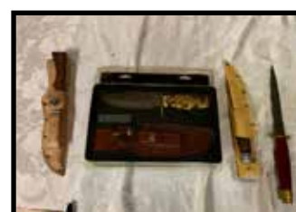
Knives - Uncle Henry, Buck, Winchester, Mossy Oak, etc.