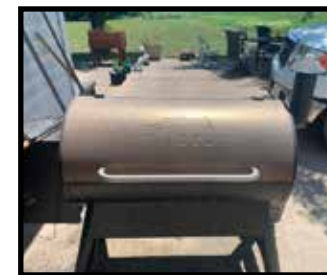
Traeger BBQ Grill