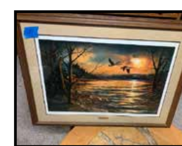
Hazy Afternoon – Terry Redlin