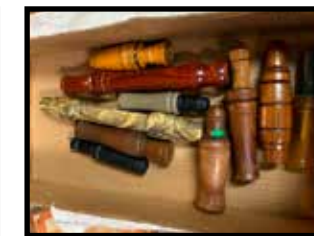
Lot duck calls