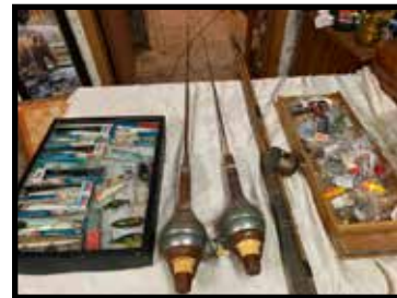
Collectors reels & lures