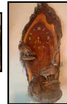
Mounted quail clock