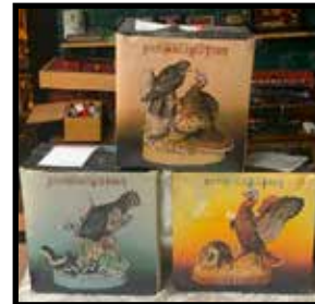
Lot Wild Turkey decanters