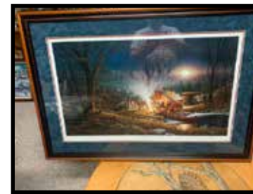
Campfire – Terry Redlin