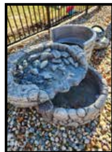
3 Tier water fountain