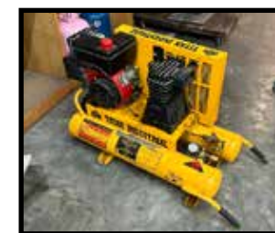
Titan Industrial air compressor 5 hp, nice unit