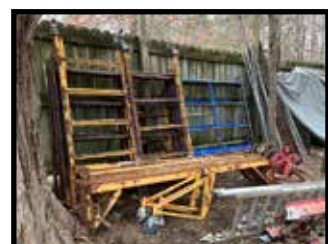
Lot brick scaffolding