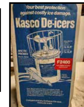
Kasco De-Icers F-2400