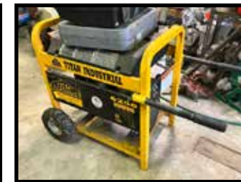
Titan Industrial 6250 electric generator