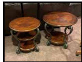
2, 3-tier lamp tables