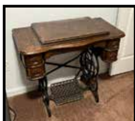
Antique oak treadle sewing machine (Henrietta)