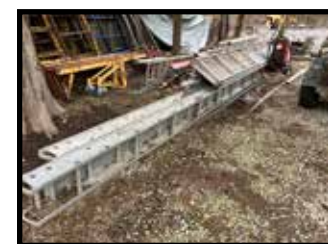
2 Aluminum walk boards approx. 30 ft.