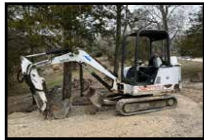
Bobcat X331 diesel track hoe, rubber tracks, good machine - 2 track hoe buckets 1 & 2 ft.