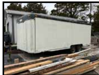
1991 20 ft. Bropes box trailer