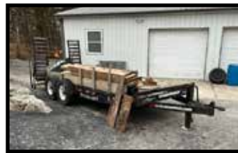
2002 18 ft. Trailer H/D tandem axle trailer w/ramps, 16 ply tires & ball hitch