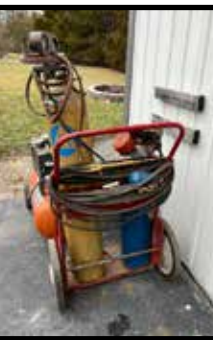
Acetylene set w/ cart