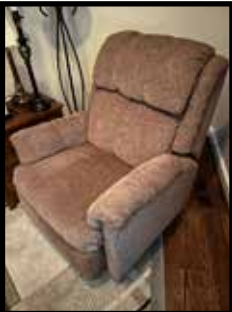
Rocker recliner, like new