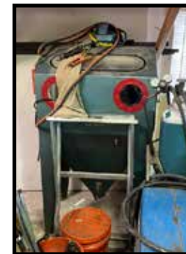
Sand blaster floor model