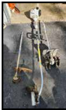
Stihl weed eater