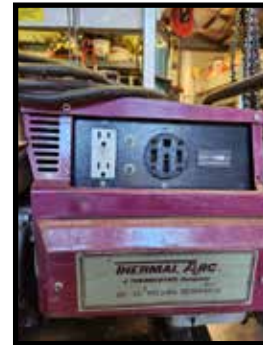
Thermal-Arc AC/DC welding generator