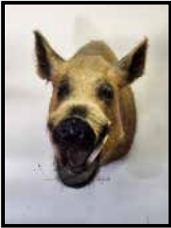
Wild Boar mount