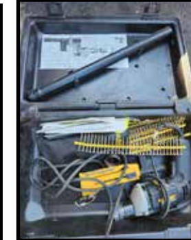
Drywall screw gun