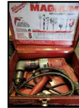
Milwaukee right angle drill