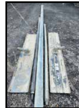
Concrete bull floats