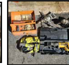
Large lot power tools