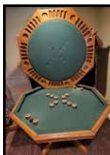
Oak 3 in 1 game table w/adjustable set of 4 oak chairs w/golf pattern, super nice set