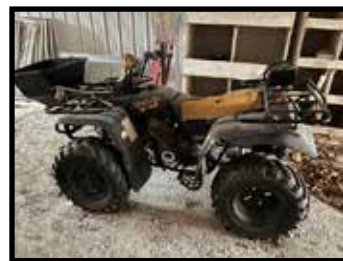
Big Bear 4 x 4, 350 4-wheeler with front mount spreader