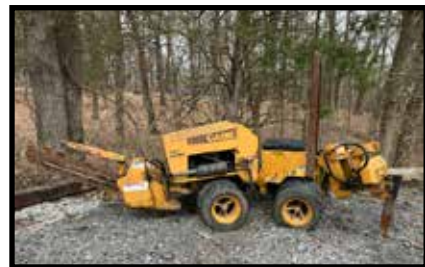
Case Maxi Sneaker gas trencher, puller, borer – 2600 hrs. good unit