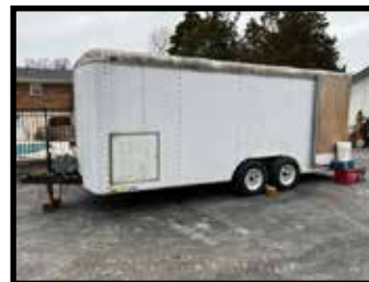
18 ft. box type job site trailer w/generator