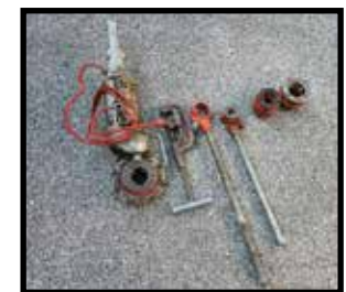
Ridgid pipe threader, up to 2"