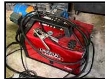
Lincoln electric welder