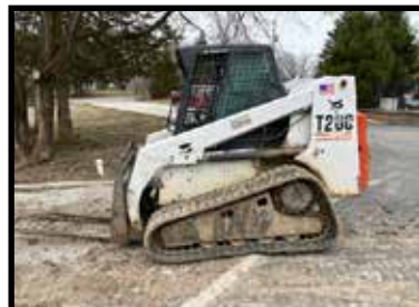
Bobcat T200 turbo diesel w/ cab & rubber tracks, foot operated, good machine