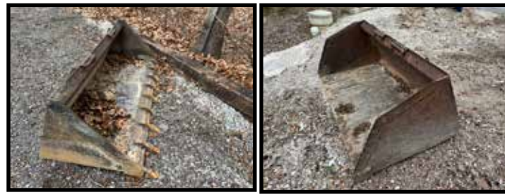
2 buckets, 1 6 1/2 ft. w/teeth