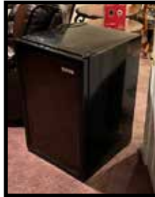
Vissani 52 bottle wine cooler