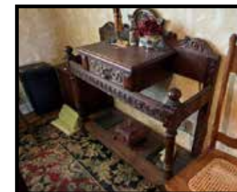
Carved serving piece