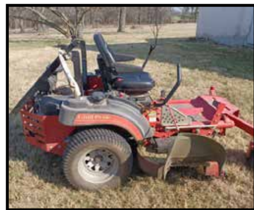
Land Pride ZT3, Accu-Z, 60" zero turn lawn mower, only 463 hours