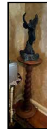
6 plant stands; several with turned base