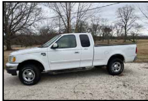
2000 Ford F-150 Lariat extended cab, 4x4 off road, white, second owner, sharp