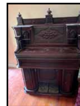
Ornate pump organ