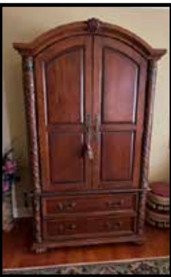
Fancy 2 door entertainment center