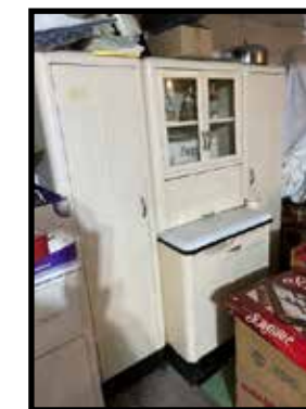
Lot 1950s white kitchen & utility cabinets; 1 with flour bin