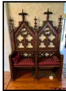
Oak church type 2 seat bench