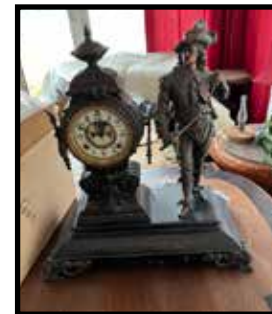
Ansonia bronze shelf clock figural, super piece