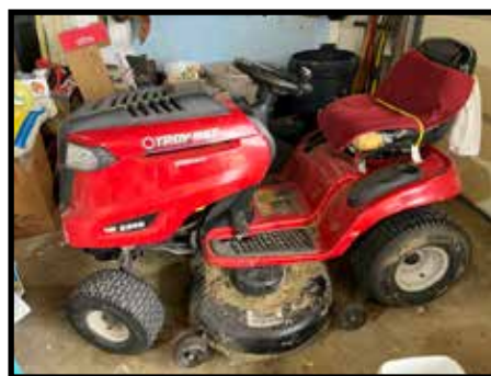
Troy Bilt TB 2246 hydrostatic riding lawn mower