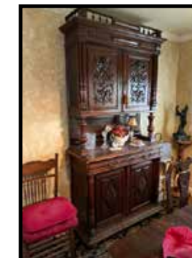
Massive oak sideboard, very ornate, super piece