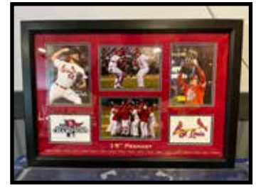
2013 St. Louis Cardinals 19th Pennant in frame