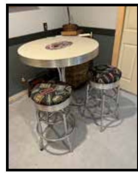
1950s repo chrome round top bar high table & 2 bar stools