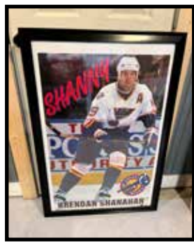
St. Louis Blues Brendan Shanahan poster in frame