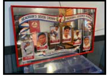
Seagram's Seven Crown Baseball Legends Mirror Saluting Seagram's 7 Crown Baseball Legends; Cy Young, Ty Cobb, Babe Ruth, Lou Gehrig, Roberto Clemente, Gil Hodges