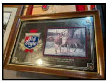
Old Style Heileman's White-Tailed Deer advertisement in frame