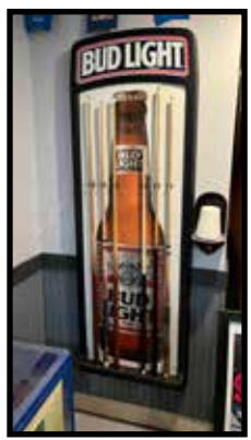
Bud Light beer cue stick holder