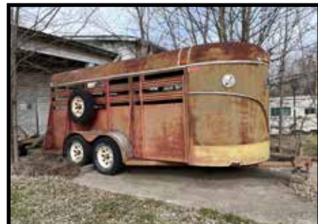
1996 16' bumper hitch stock trailer, no title