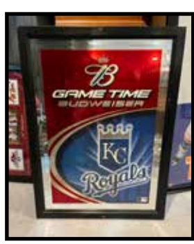
Game Time Budweiser KC Royals mirror advertiser