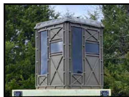
Stationary stand to be torn down by buyer