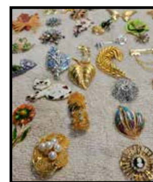
Vintage lapel pin collection