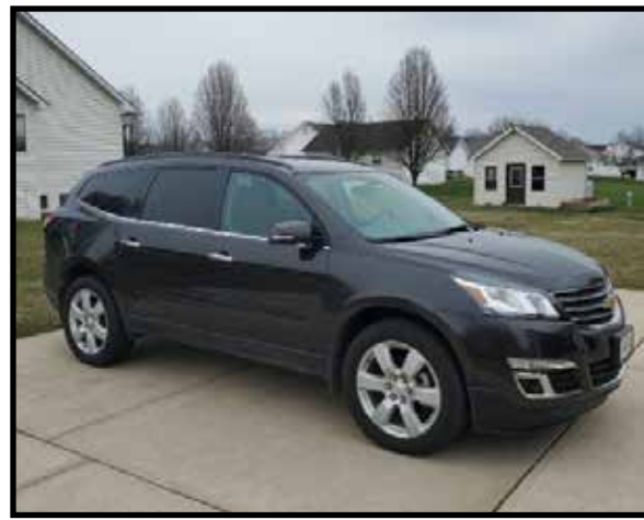
2017 Chevrolet Traverse LT LUTL 4x2, 3.6L gas, CD player, metallic black with only 28,XXX actual miles, one owner, kept in garage, new tires, nonsmoker, no pets, VIN 1GNKRGKD5HJ330513 (This is my mom & dad's car, Earl & Mildred Thornhill, they bought it new, it's showroom condition)