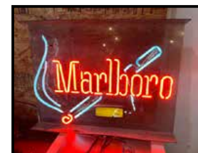
Marlboro neon sign