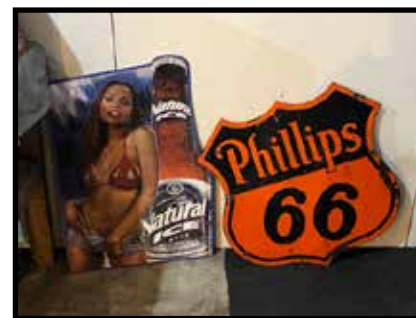
Antique double sided Phillips 66 Service Station sign