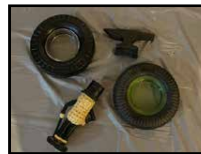
Lot rubber tire ash trays