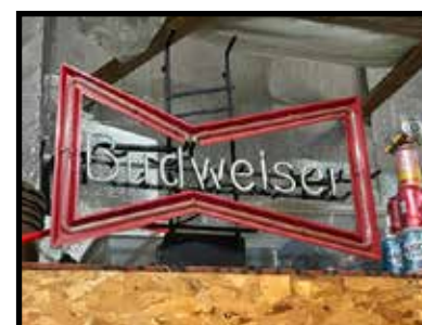
Budweiser bow tie neon sign