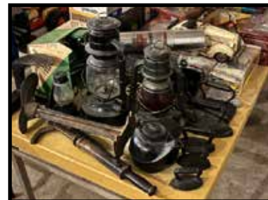
2 barn lanterns; 1-Dietz & 1 Wizard