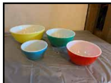
Pyrex bowls & refrigerator dishes