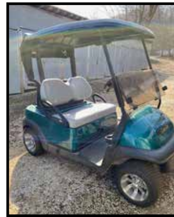
2014 Model 12 Club Car, 10" wheels, new batteries in 2022, tinted windshield, bag cover, like new

- 1917 Model T, 3 door Touring car w/title, to restore (This was Gene's dad's car) Gene was in the process of restoring when he got sick