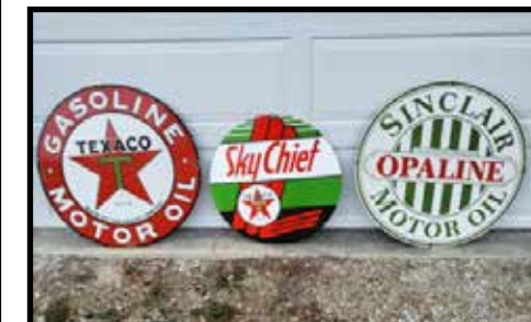
Texaco, Sky Chief, Sinclair (new signs)