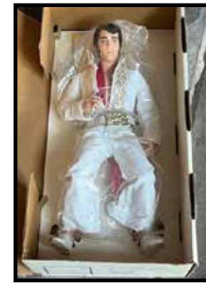
Elvis Presley World doll in box