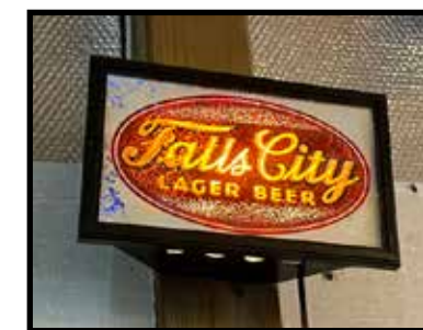
Falls City lager beer lighted sign