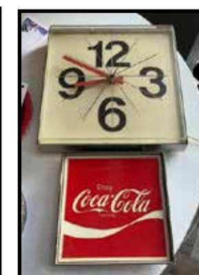
Coca Cola clock