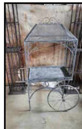
Metal flower cart