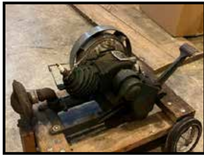
Model 92M Maytag motor, good condition