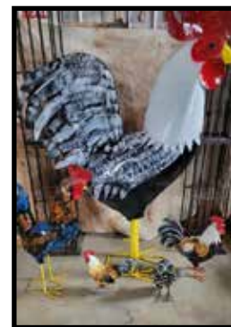
Large metal rooster