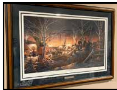
1994 Night of the Town Terry Redlin print in frame