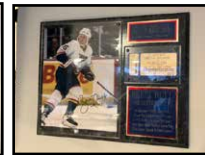
Lot Brett Hull memorabilia