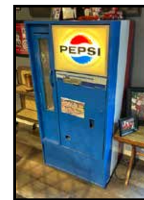
Pepsi 25 cent soda machine, small machine, works