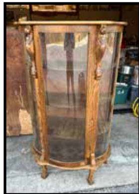
4 oak 1 door china cabinets; 1 corner type