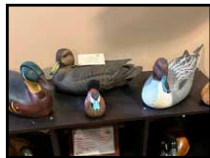
13 DU decoys by Jules Bouillet, limited addition, hand carved