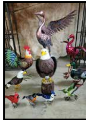
Lot metal animal yard art