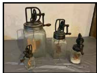
Dazey butter churns; 1 quart to #40