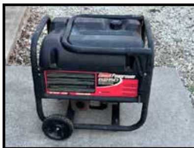
Coleman 6250 generator