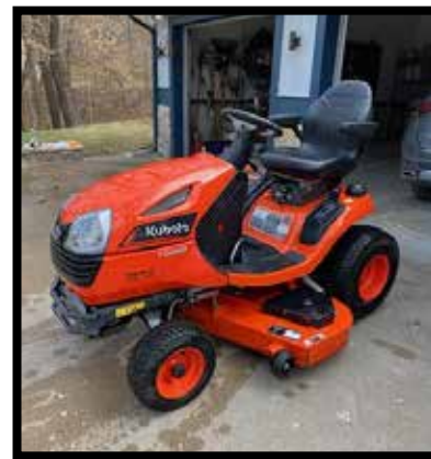
2020 Kubota T2290 lawn tractor, hydrostatic w/48" deck, like new