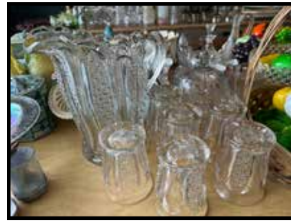
Lot Early American glassware