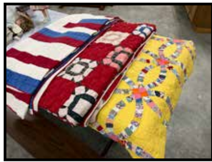
Quilts – red patchwork, yellow, orange wedding band, red, white & blue patriotic