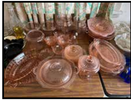
Lot pink depression pitchers, candy & serving bowls, salt & pepper, etc.