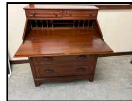
Davis drop front walnut desk