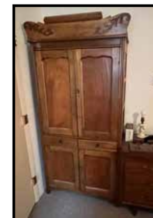
Pierced sided solid panel kitchen cabinet