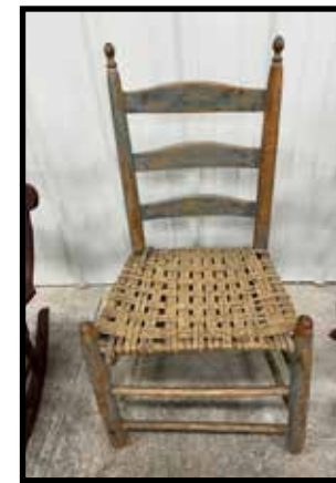
Kunze chair, MO piece