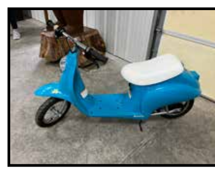
Razor Moped, battery type