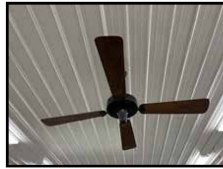
1914 century store type ceiling fan (Warrenton Rexall Drug Store)