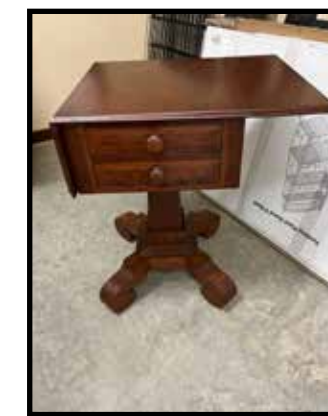
Empire style drop leaf 2-drawer end table