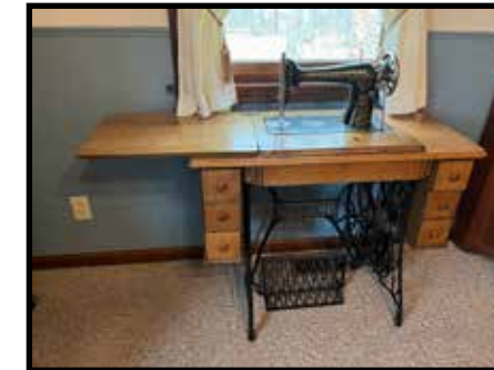
Singer oak treadle sewing machine, nice