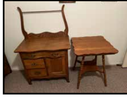
Oak wash stand