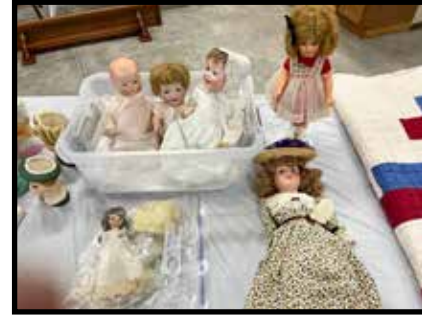
German Armand Marseille 370 AM/DEP doll