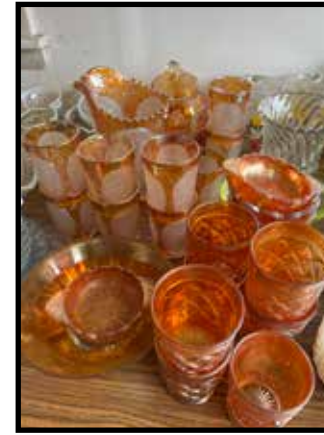
Lot carnival glass, 1 water pitcher set