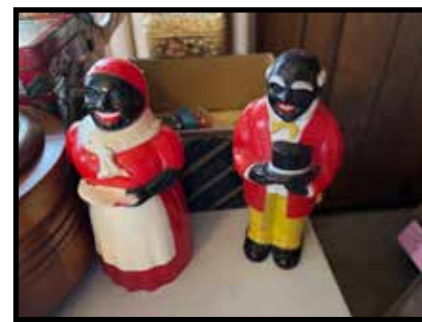
Aunt Jemima & Uncle Moses, salt & pepper