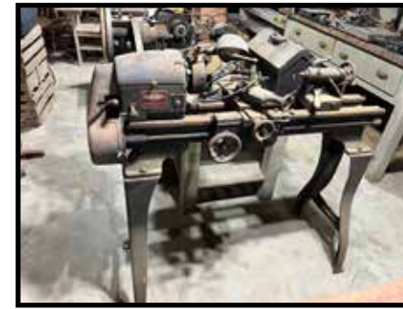
Power-Kraft metal lathe