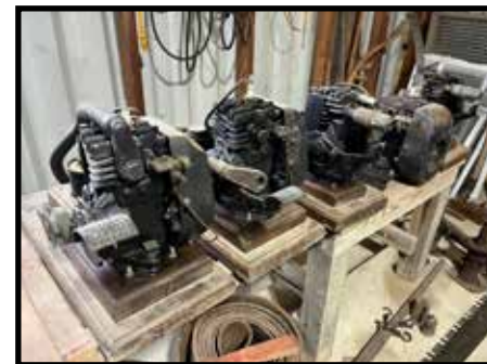
3, B & S washing machine engines