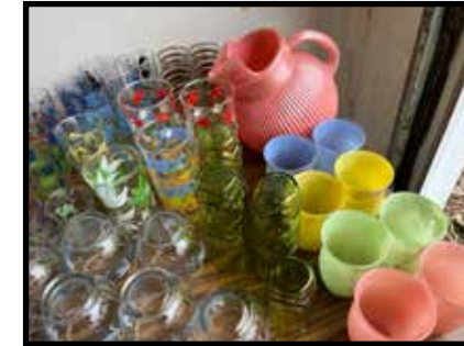
1950's water glass sets