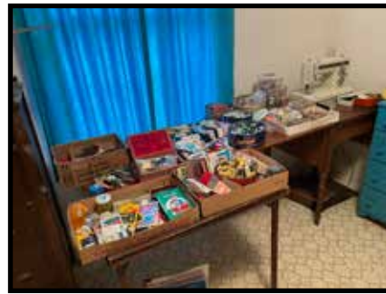
Kenmore sewing machine w/cabinet