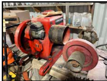
IH Hopper cooled Model LB engine