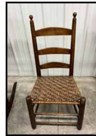
Middleton chair, MO piece