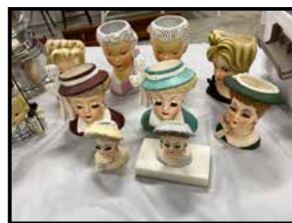
10 Head vases, 1 rare girl w/umbrella