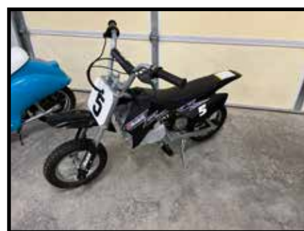
Razor MX350 Motorcycle, battery type