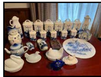
Lot Dutch Lighthouse spice sets