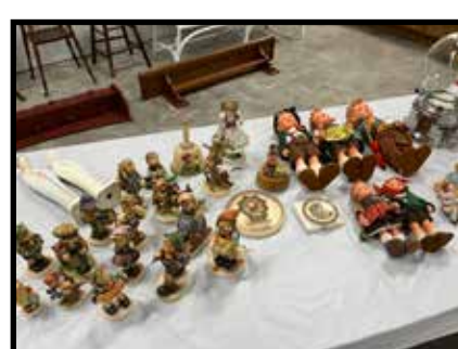
15 Hummel figurines