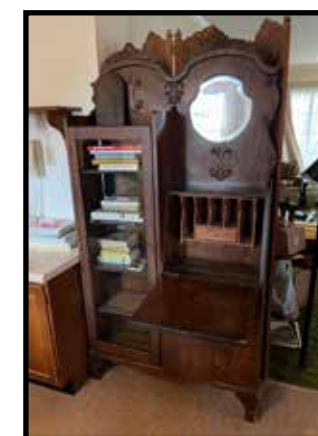
Oak drop front secretary, 1 door, nice