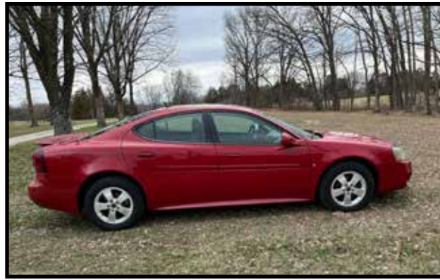
2006 Pontiac Grand Prix 3.8L, front wheel dr., auto w/air, power doors & windows, sunroof, one owner, 159,000 miles, extra clean