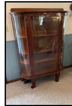
Oak curved glass, 1 door china cabinet, nice piece