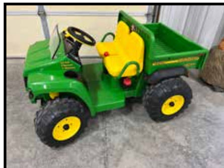
JD Gator 4 x 4, HPX, battery type