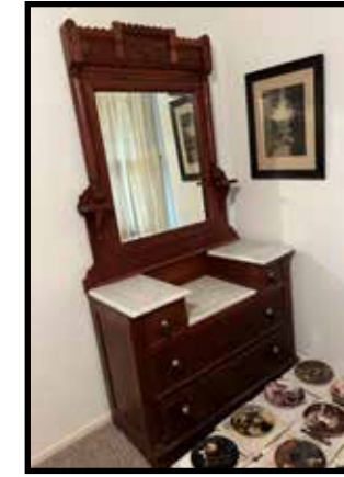
Walnut white marble top dresser w/tear drop pulls