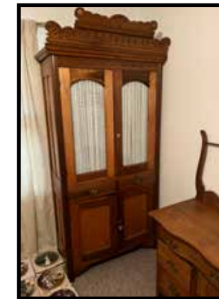
Kitchen cabinet w/glass panel doors