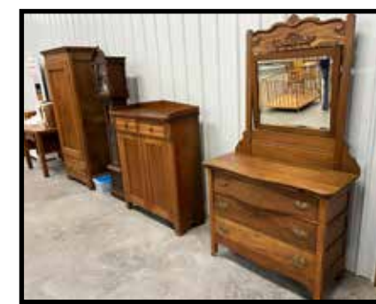
Oak dresser w/mirror (bow front)