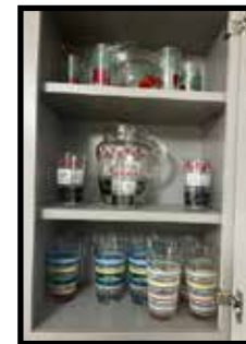
1950's pitcher, glass sets