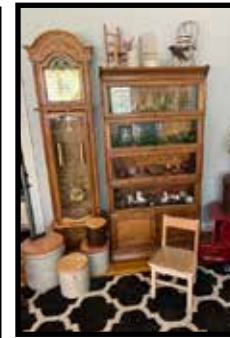
Oak 4 stack lawyers bookcase w/2 door cabinet base