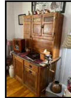
Wilson oak roll top kitchen cabinet, complete w/flour bin & art glass, super nice piece