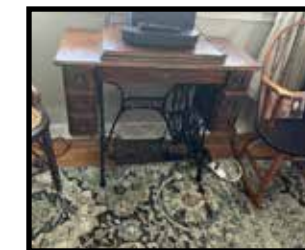
Oak cabinet Singer treadle sewing machine, nice piece