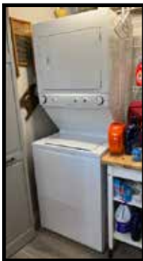
Frigidaire stack type washer, dryer, white, gas, like new