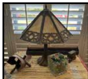
Slag glass parlor lamp, beautiful piece