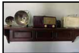
Carbide lights, large & small