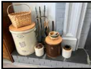
Western 12 gallon 2 handle stone jar