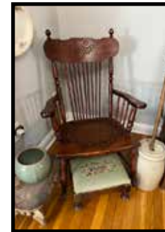
Spindle & press back armed chair