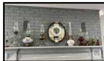
10+ oil lamps