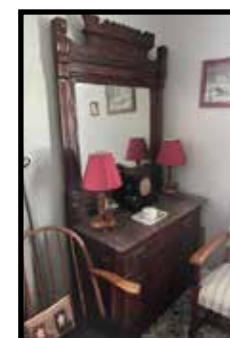
Chocolate marble top dresser w/mirror