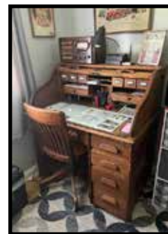
S type oak roll top desk (Craig's Grandpa's)