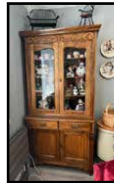
Step back 2 door kitchen cabinet, nice piece