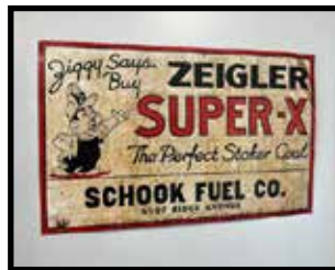
Zeigler Super X School Fuel Co. The Perfect Stoker Coal advertising sign