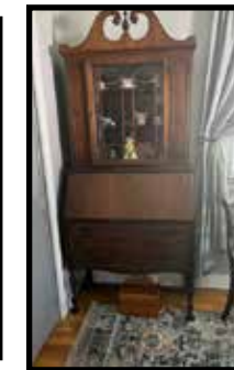
1930's drop front secretary