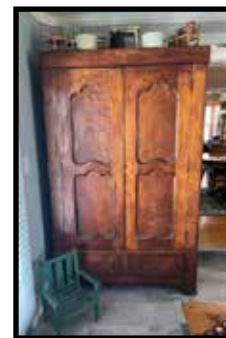
2 door walnut knock down wardrobe