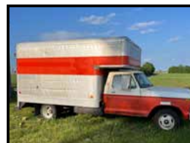
1978 Ford U-Haul truck with 11' box bed with over bed cab, gas rebuilt engine, 4 speed, tandems, runs good