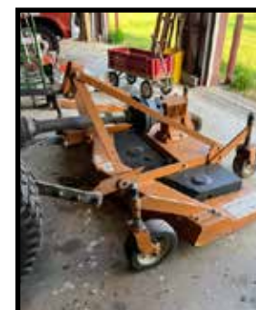
Woods RM 550 3 pt. finish mower with side discharge, like new