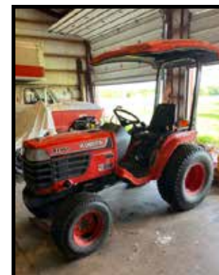
Kubota B2400 HST Bi speed turn power steering, turf tires & canopy, 3 pt with PTO, same as new, only 450 hours