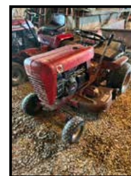
Wheel Horse L lawn ranger

- Walk behind 2 wheel garden tractor with front mount blade