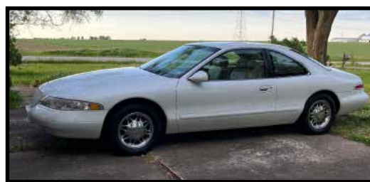
1998 Lincoln Mark VIII LSC with 32V intech V8 (mustang cobra motor) 2 door with sun roof, leather interior, pearl white, 108,706 miles, kept garaged, super, super clean