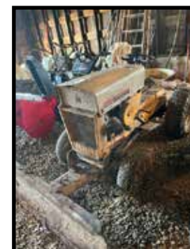
Cub Cadet 100 lawn tractor with mower deck & front mount blade