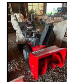
Snapper 8hp 24" walk behind snow blower series 6, like new