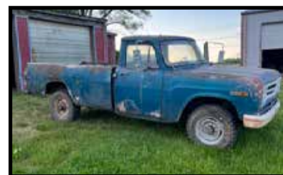
1966 IH Pickup, 4 wheel drive with lock out hubs, 304 with 4 speed with dump bed & PTO with title, runs & drives, dump bed works, rare find