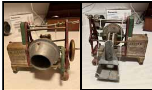
Jaeger cast iron toy concrete mixer/ shovel