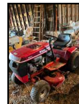
Wheel Horse 252 H, hydro lawn mower