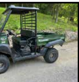
2021 Mule 4 wheel drive automatic, manual dump, 84 hours, bought new