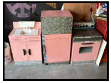
1960's Wolverine kitchen set