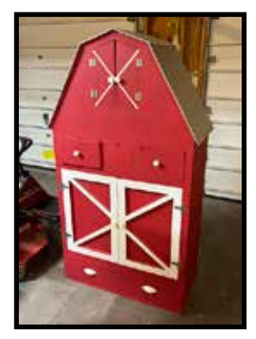
5' handmade barn toy box, neat piece