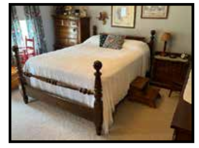
4 piece bedroom set, queen bed