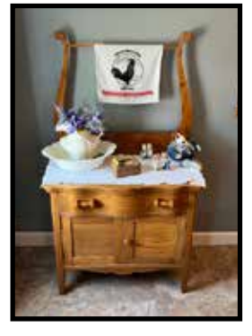
Oak washstand (refinished by Grandpa Gilbert )