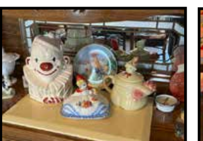
McCoy clown cookie jar & Little Red Riding Hood butter dish