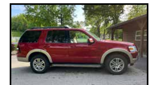
2010 Ford Explorer Eddie Bauer, 4x4, loaded, new tires, 102,XXX miles