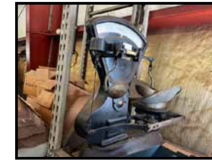
Toledo counter scale