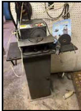
Accu-Finish series II tool sharpener, diamond wheel, floor model