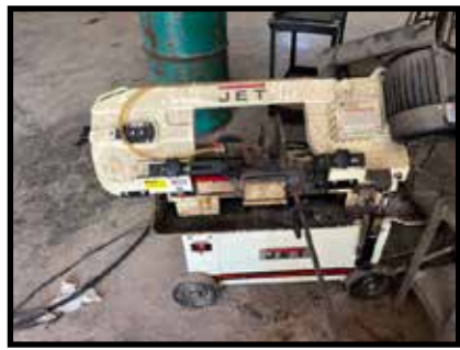
Jet metal band saw 3/4 HP 110, floor model