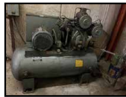
Ingersoll Ram, 3 phase commercial air compressor