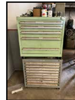
14 drawer storage cabinet