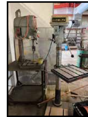
Delta Model 70-200 floor model drill press