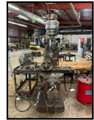
Bridgeport Mill, 3 phase – S-J – 193337, good machine