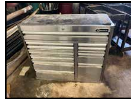
Kobalt S/S toolbox