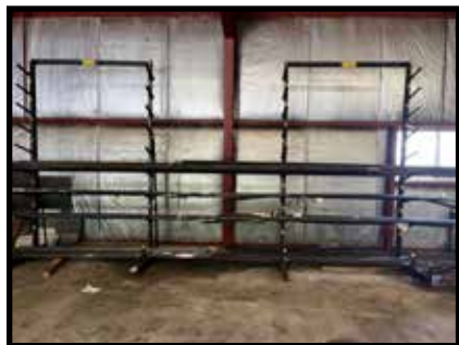
4 – 9 rack floor type metal racks