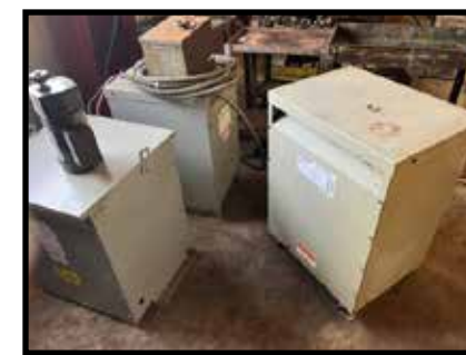
3 transformers; 1 – GE #9T23B3883