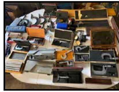
Lot machinist precision tools; mics & calipers