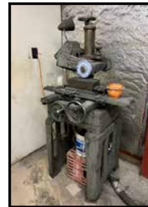
Delta tool maker grinder