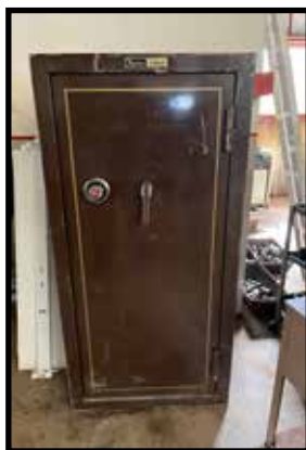
Browning ProSteel floor model gun safe