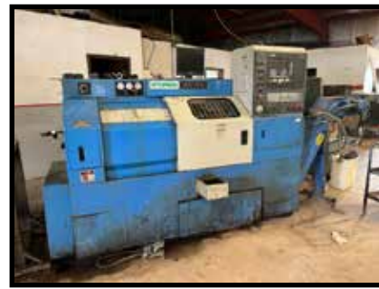
1995 Hyundai Hit 18S lathe, bought new