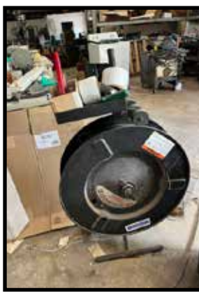
Signode banding reel with band