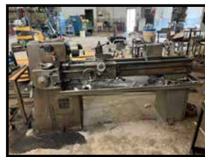
Clausing lathe Model 6913