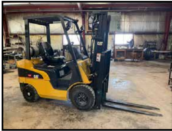
CAT model PC 4000 LPG forklift, serial number: AT3450222, power steering, 3 stage side shift, bought new only 575 hours