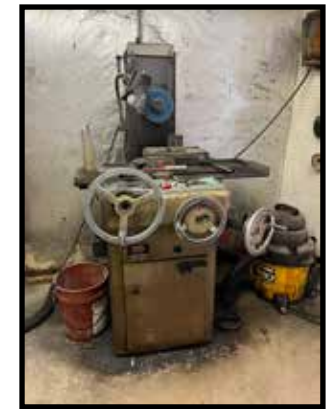
Ko-Lee surface grinder SN 19652