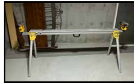
DeWalt power miter saw w/stand