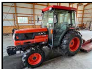
Kubota L4310, SN: 70379, HST cab, one owner, air conditioning doesn't work, 1389 hours, diesel