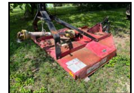
Pittsburg Field General 3 pt. 5' brush hog, bought new at Mordt's