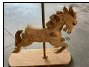
Hand carved child's carousel horse