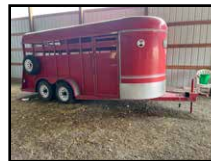
2004 Pro Stock stock trailer with walk in & divider door, red, kept in shed, like new