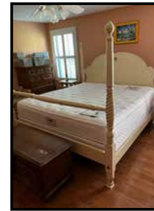
King size bed