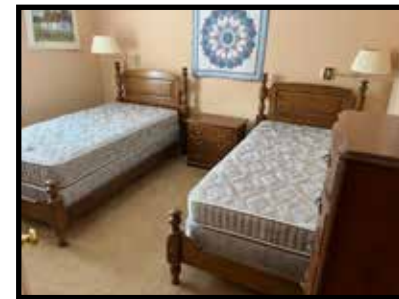
Set twin beds