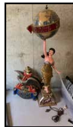
Schlitz Statue of Liberty bar light