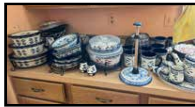
1 set in blue; service for 6 plus accessories