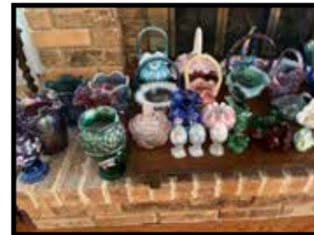
Eggs, elephants, whale & frog