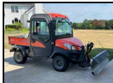
Kubota RTV 1100, diesel, 4X4, power steering, cab, heat & air, radio, auto dump bed, SN 26238, 740 hours, with 6 ft. sno-pro blade