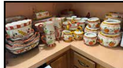
1 set Fall pattern; service for 6 plus accessories