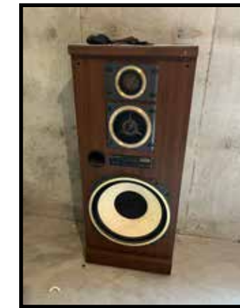
Set Fischer STV-762 floor model boombox speakers