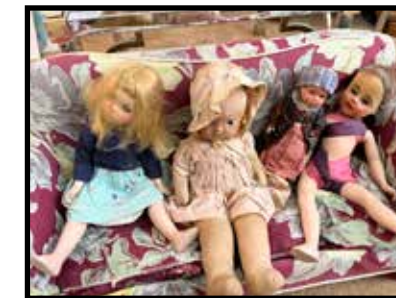
Antique dolls and doll sofa