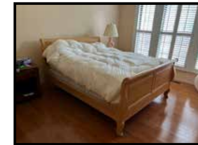
Queen size bed, complete set