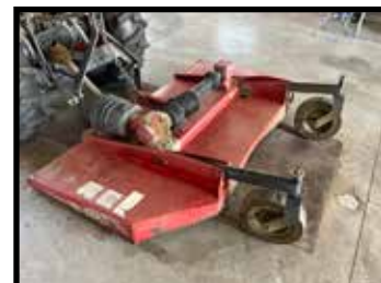
Bush Hog 7ft finish mower