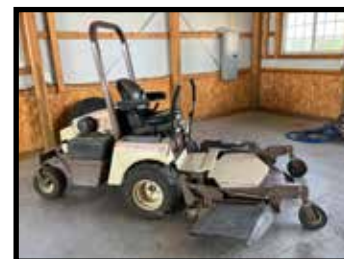
Grasshopper 725 D, max torque diesel 61", 900 hours, one owner