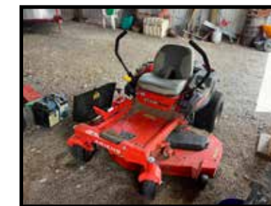
Ariens Edge zero turn 21.5 hp, 52" cut