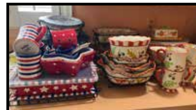
1 set red, white and blue

Due to my heath, I am selling my home & will sell all the following: