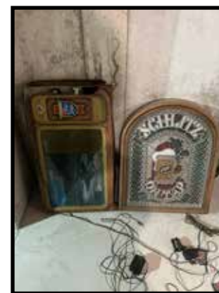
Schlitz on tap bar light