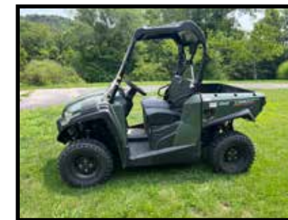
Kymco UTV 4x4 UXV 450 Turf, gas with manual dump bed, automatic, only 27.2 hours, bought new