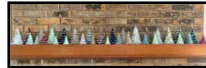
42 Christmas trees