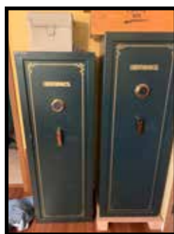
2, Brinks 15 gun safes, great shape