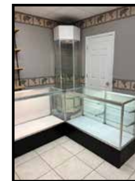
2, 4 ft., 1, 6 ft. floor type – 1, 8 ft. tall octagon