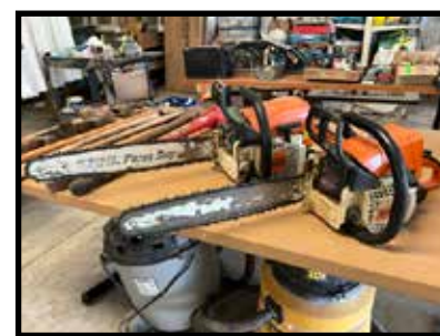
Stihl MS 280 & Stihl 025