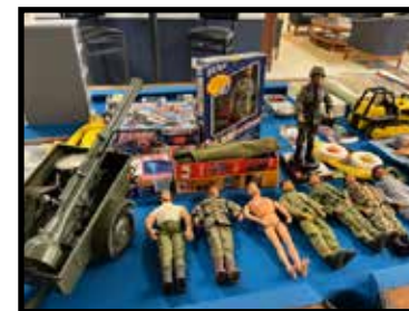
GI Joe's & accessories