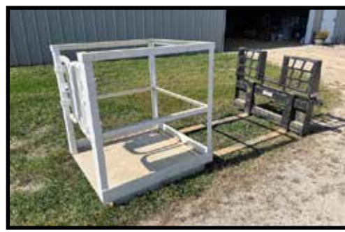
Set 48" forks