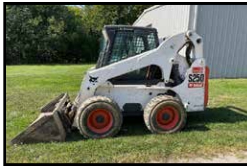
Bob Cat S250 diesel skid steer w/cab, heat & air, tire type, power Bob Tach, foot control, 2nd owner, approx. 12xx hrs., real nice