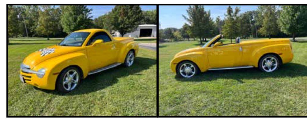
2004 Chevrolet SSR classic automatic w/retractable hard top, 74,XXX miles, sharp