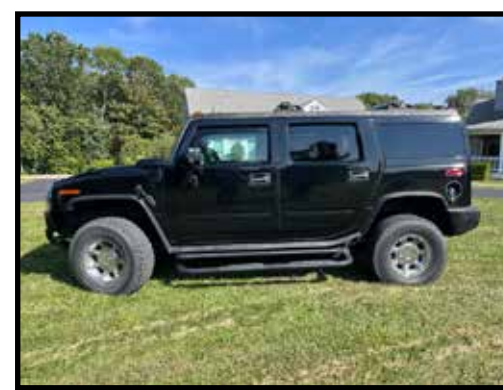
2004 H2 Hummer, black, kept garaged shows 230,XXX miles