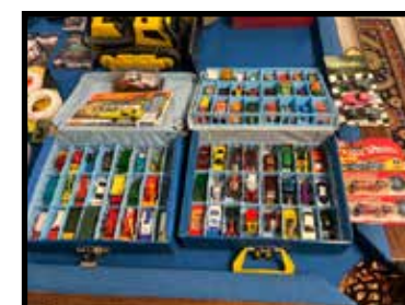
Vintage Matchbox cars