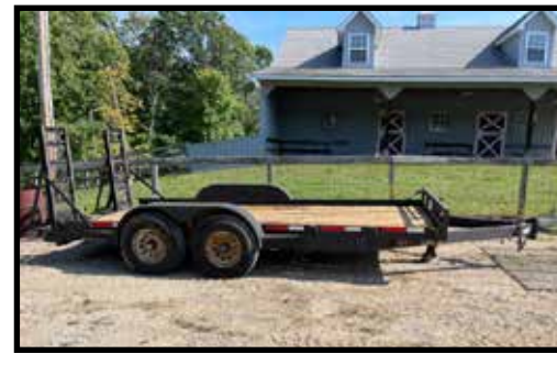
16 ft. Bob Cat trailer, 12,000 lb. tandem axle, ball hitch w/drop down ramps