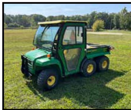
John Deere 6x4 gator w/Curtis cab w/heat, gas, shows 935 hours, sharp