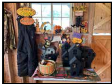
Lot Halloween décor