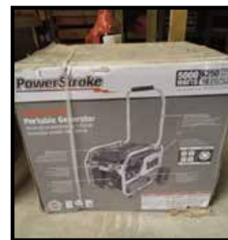
Power Stroke 5000 watt portable generator