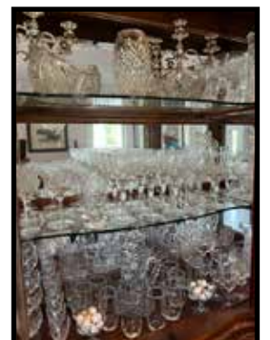
Pitchers, bowls, stemware, servers, decanters, sherbets