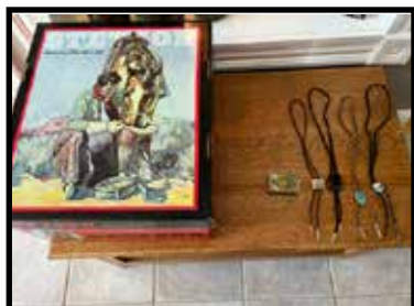
Stetson 7/8 corral man's hat & Lot men's bolo ties