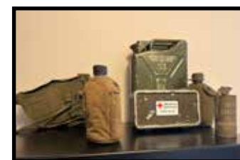
M-18 smoke boom red PB-44-3