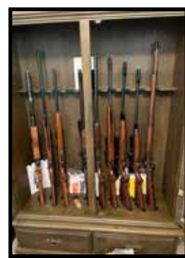
US Springfield Model 1847