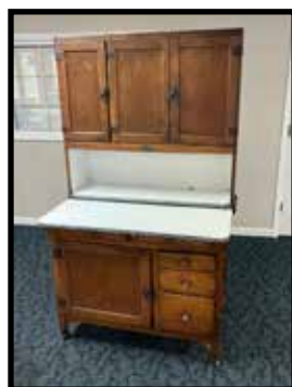
Sellers kitchen cabinet