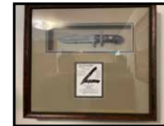
In Country Limited Edition Vietnam Commemorative handmade knife by Jim Sornberg 1988, #131 of 365 is displayed