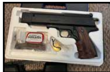
Beeman P1 20 cal air pistol