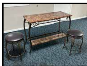
Bar table w/2 stools