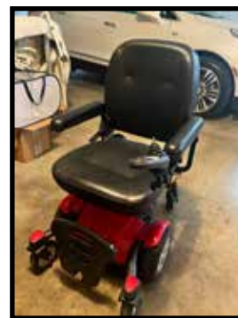
Handicap scooter, like new condition, new batteries