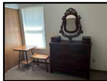
Walnut 3 drawer dresser w/swivel mirror & carved pulls