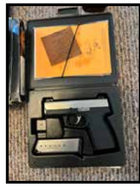
KAHR P9, 9mm