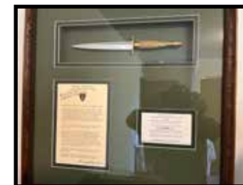
D-Day Invasion Commemorative Commando, knife 1942 w/certificate & authenticity paper, in display