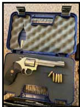
Smith & Wesson 357 Magnum, 5 shot, 5" barrel