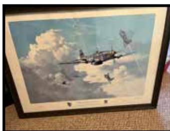
Playing The Last Ace, #10 of 750 by Heinz Krebs, print in frame