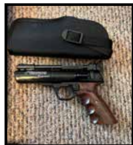
Tempest .177, 4.5 cal Webley & Scott Ltd. Pellet gun