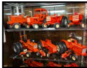
AC D21 w/duals, 2 piece set