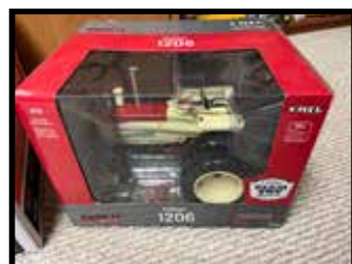
Case Farmall 1206 National Farm Toy Museum wheat houser