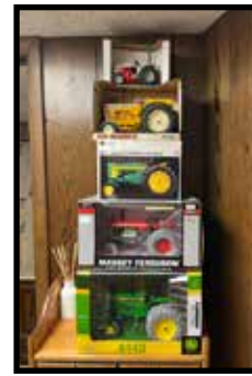
AC D21 Ertl (yellow) #1283, N.I.B.