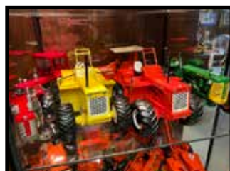
Oliver Super 99 diesel 1/16 scale