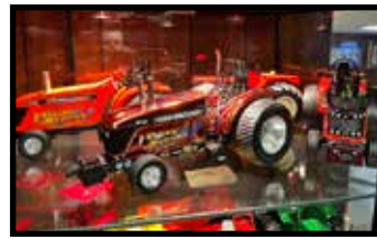
Young Blood DT225 AGCO pulling tractor, AC color