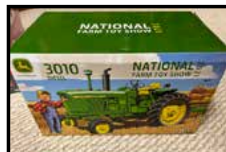
National Farm Toy Show 2021 JD 3010 diesel

2 GLASS DOOR LIGHTED FLOOR MODEL SHOWCASES