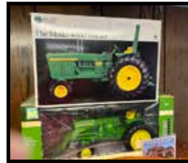
JD 4000 Precision #5684 w/box 1/16 scale