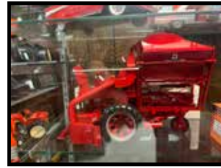
Farmall super M-314 cotton picker