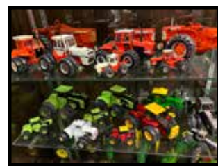
Versatile 935, 2 piece large & small scale