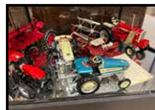
1/16 Resin 50th Anniversary IH turbine set, HT 340 & HT 341 Dan Meyer VP OEM sale