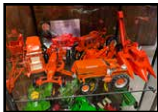
AC grader tractor, 1/16 scale