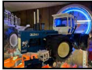
Kintz 640, 2 piece set, large & small