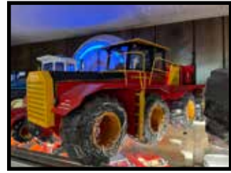
Versatile Big Roy, Jaegers Auto Body large scale