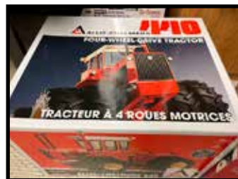
AC 440 4 wheel drive, 2 piece set, N.I.B.