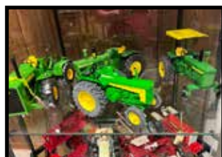
JD 5010, 8020, 850 diesel, 1/16 scale