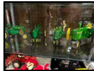
JD A, B, H etc.