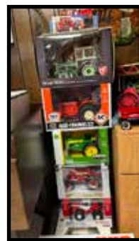
AC D21 National Farm Toy Museum 1/16 scale, N.I.B.