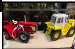
IH Turbo 4160 1/16 scale