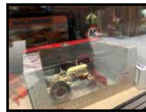
IH McCormick Deering Farmall cub, Wheels of Time, 1/16 scale, N.I.B.