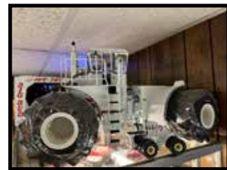
2 Big Buds 760hp & 900hp large scale 16V-747, 2 piece sets