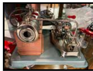
Electric steam engine, Jensen Mfg.