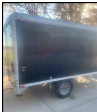
8'x12' box trailer, single axle (no title)