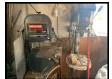
Craftsman 12" 1 hp. band saw