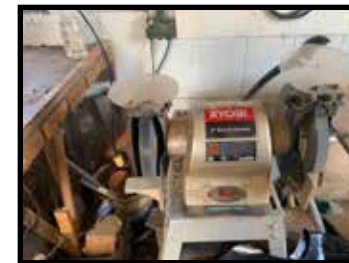
Ryobi 8" bench grinder