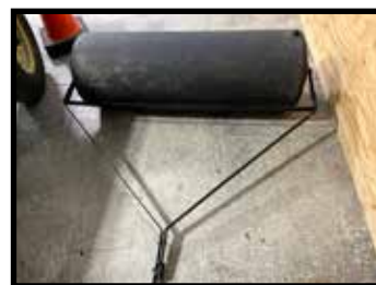
Poly pull type yard roller approx. 4 ft