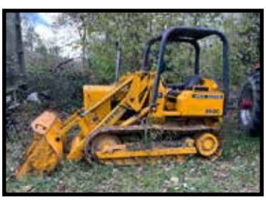
John Deere 350C crawler-dozer (was running , motor got hot)