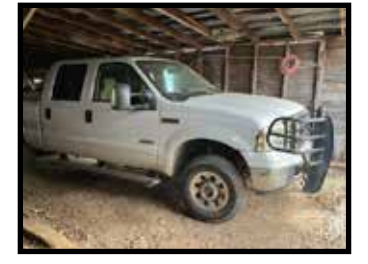
2006 Ford F250 XLT Super Duty Power Stroke, V8 turbo, diesel, FX4 off road, 4 door, automatic, shows 213,652 miles