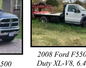
2008 Ford F550 Super Duty XL-V8, 6.4 power stroke, diesel single cab, 4 wheel drive, 6 speed manual, flatbed w/5th wheel hitch