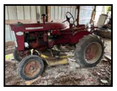
Farmall 140 wide front w/belly mower, SN11337