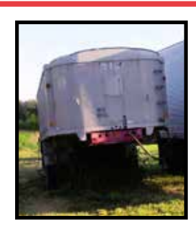
1978 22 ft. Montone road tractor type dump trailer (Rock Trailer)