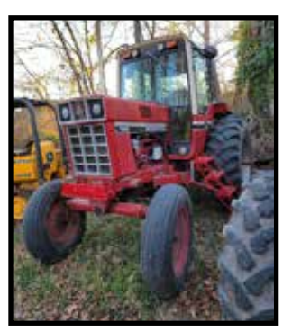
1981 IH 1086 black stripe w/cab , 20.8-38 tires, set up with Case 2355 loader (will sell separate)