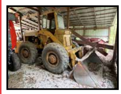
Michigan 85 wheel loader

- John Deere backhoe attachment for 350C - 7.3 IH diesel motor