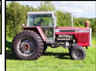
MF 2745 w/cab, 20.8-38 Firestone tires like new. shows 4725 hrs., SN 9R-003397