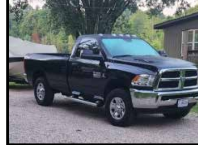
2018 Dodge Ram 2500 Diesel single cab, 4 wheel drive, automatic, bought new, 47,XXX miles

- John Deere backhoe attachment for 350C - 7.3 IH diesel motor