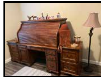
Oak s-type roll top desk full size