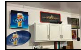
Miller Lite adv.