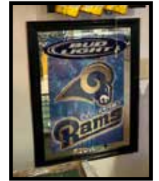
Bud Light St. Louis Rams mirror