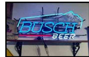
Busch neon bar light