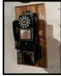
1950's black pay phone