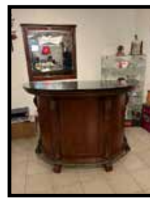
Portable bar very ornate