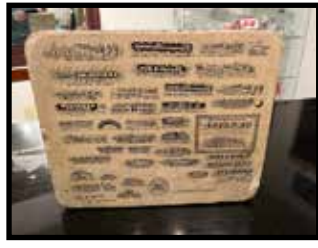
Printers block door stop out of original Wright City High School