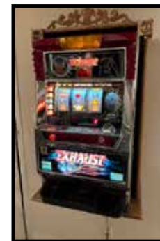
Exhaust Real Motorcycle Spirits slot machine, quarter type, nice