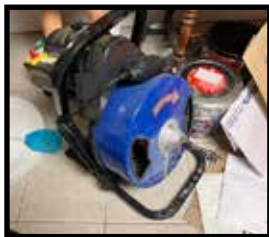
Electric hydro star sewer auger, like new