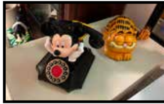
Mickey Mouse phone & Garfield phone