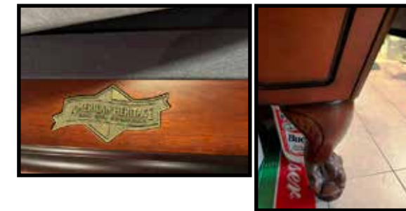
Watson (American Heritage) regulation size pool table, 3 piece slate, dark wood finish w/ massive ball & claw feet. Budweiser cover, complete w/cue sticks & rack, beautiful piece

(to be picked up & viewed at #72 Winchester Court, Wright City)