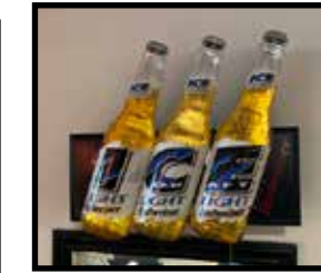
Ice Light Budweiser 3 bottle bar light