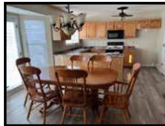
Oak dining room table w/6 chairs (2 captain), claw foot, nice set