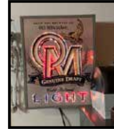
Old Milwaukee Genuine Draft lighted bar sign