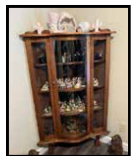
Oak 1 door corner curio cabinet