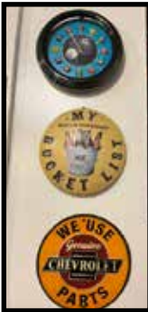
My Bucket List Ice Cold