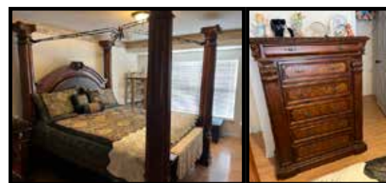
Rothman massive 4 poster king size bed, 4 piece bedroom set w/chest, dresser w/mirror & bedside chest, beautiful set (to be picked up & viewed at #72 Winchester Court, Wright City)