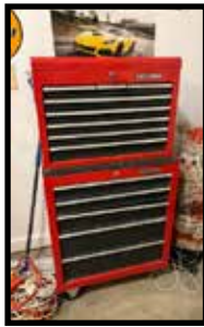
Craftsman 2 piece roll around tool chest