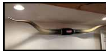
Set long horn horns, Budweiser