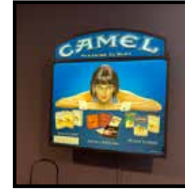
Camel cigarettes adv.