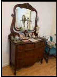
Oak bow front dresser