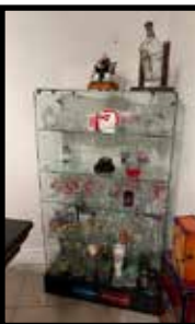
100+ Shot glass collection