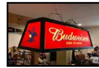
Budweiser King of Beer pool table light