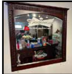
Budweiser wall mirror