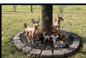
4 piece set concrete deer yard decor