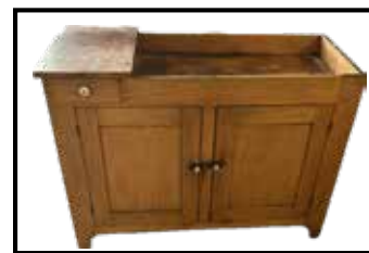
Primitive dry sink