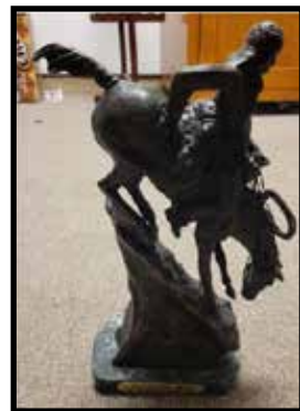
Mountain Man, Frederic Remington