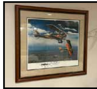
Professional framed & matted, 1/10, signed by artist w/scale model