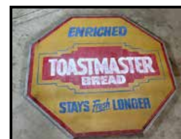
Toastmaster Bread wooden sign