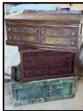
2 spool cabinets