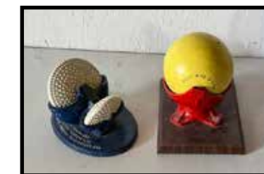
Ball & Hargrove