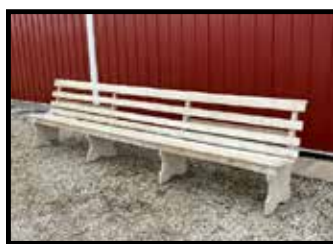
12 ft. Church bench from Whiteside, MO