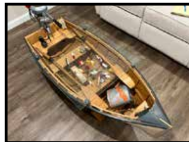
4 1/2 ft. Handmade boat, super piece