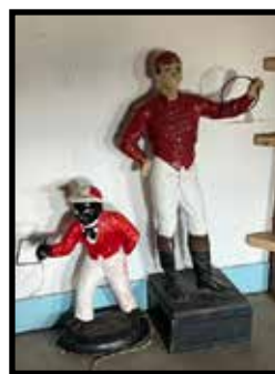
Large cast aluminum yard jockey & Concrete Black Americana yard jockey