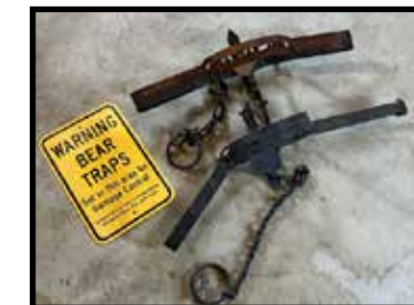
2 Bear traps & 2 Wolf traps