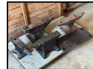
Haybudden, Mousehole, "Eagle Emblem", 125 lbs. and smaller