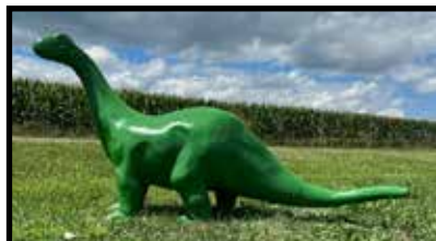
8 ft. Aluminum Sinclair "Dino"