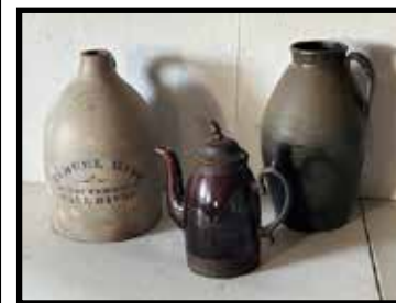
F.T. Wright & Son, Taunton, Mass #2 crock jug