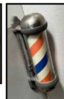
Barber Pole (neat piece)