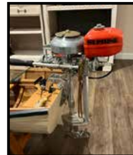
Neptune Model 17A1, SN E32413, mint condition