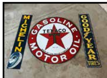
Texaco porcelain sign