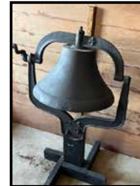
#4 large school bell