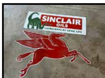
Pegasus porcelain sign