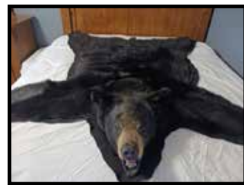
5 ft. Black bear rug, like new, heavy coat