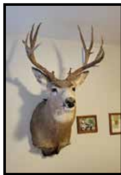
12 pt. trophy mule deer shoulder mount, nice