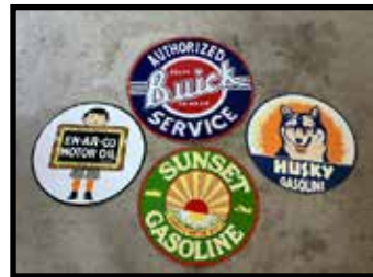
Buick porcelain sign