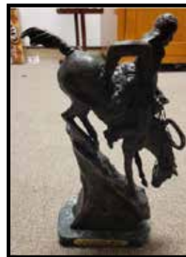
Mountain Man, Frederic Remington