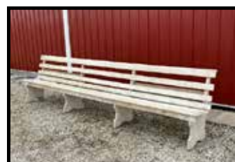
12 ft. Church bench from Whiteside, MO