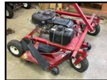
Swisher 60" trail mower