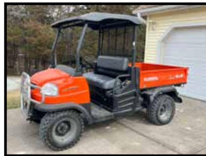
Kubota RTV 900 diesel, 4x4, power steering, hydraulic dump bed, 368 hours, nice machine