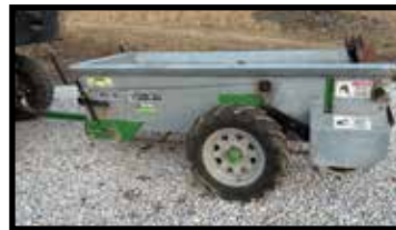
Frontier MS1102 manure spreader