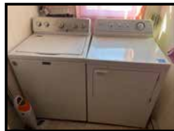
Maytag Centennial MCT automatic washer, white, nice & Maytag Performa electric dryer, white, nice