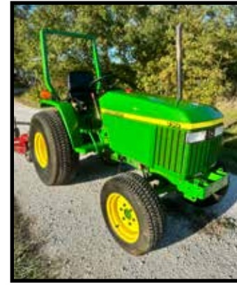
2000 John Deere 790, 4 wheel drive compact utility diesel tractor with roll bar, 3 cylinder engine, 30 HP, power steering, rear PTO, ID # LV0790G291902, 494 hours, bought new