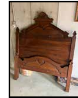
Twin size bed