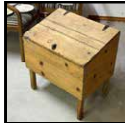
Salt box, STL