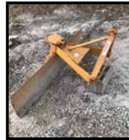
King Kutter 5' 3 pt. blade