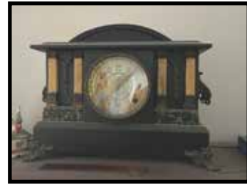
Ingraham shelf clock