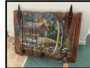
Hand painted barn door hall tree