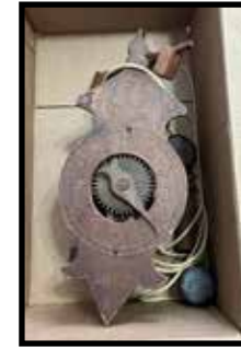
Chicago World's Fair Columbus Expo Cuckoo clock