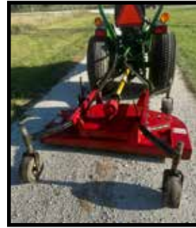
3060 Taylor Way 3 pt. finish mower, side discharge