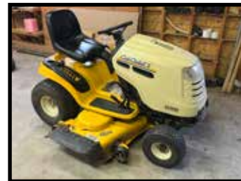
Cub Cadet LT 1050, hydrostatic, 50" deck, 780 hours