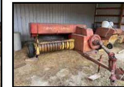
New Holland #276, string tie hay baler