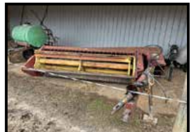
New Holland #489, 9 ft. mower-conditioner