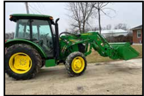
2020 John Deere 5065E front wheel assist diesel tractor w/cab, sells with JD 52M front end loader 16.9-28 tires bought new, only 565 hours, same as new