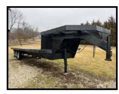
24' Triple axle gooseneck flatbed trailer, homemade, no title