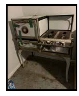
Antique gas cook stove, 1930's era