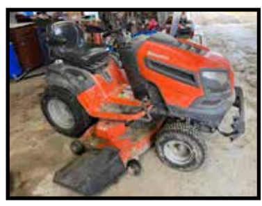
Husqvarna riding lawn tractor, GT 52XLS, 24hp