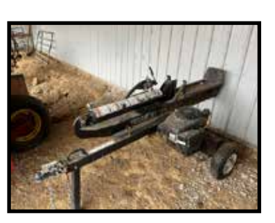
Country Tough 23 ton, 8 hp., log splitter