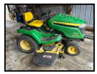
John Deere X530 multi terrain riding lawn tractor, 24 hp w/54 inch deck