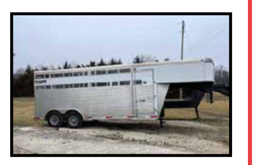
2016 Shadow aluminum 18' floor gooseneck horse trailer w/divider & walk inside door, nice trailer w/title