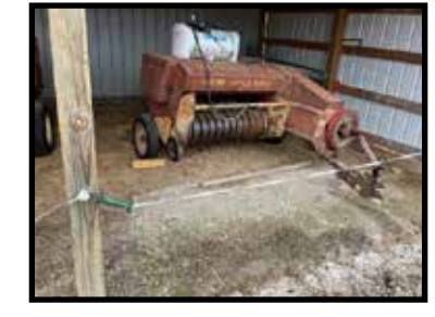
New Holland #270, string tie hay baler