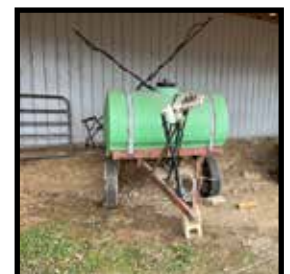
300 Gallon spray tank PTO type

(Note: Both balers were went through last year)