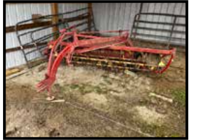
New Holland #56, side delivery hay rake

(Note: Both balers were went through last year)