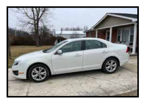
2012 Ford Fusion SE, 4 door, bought new extra clean, 174,xxx miles