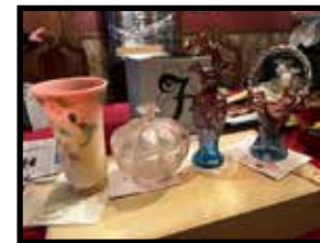
Fenton Glass The Connoisseur Collection