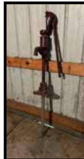
Deming Co. OHIO well pump