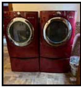
Maytag 4000 series, 4.5 cu. ft. auto washer (red) & Maytag 5000 series w/steam, MCT commercial technology, electric dryer (red) set, like new