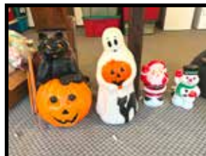
Plastic 1950's Halloween Pumpkin/Cat