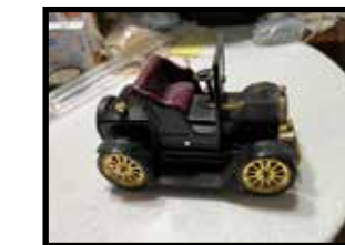
1917 Model T cigarette lighter, dispenser