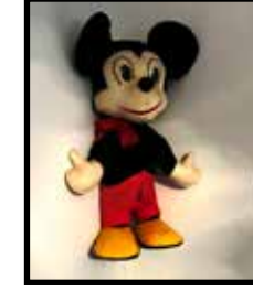
1950's large Mickey Mouse