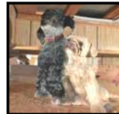
Kron poodle lamp