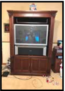
Massive Mahogany Entertainment Center, cost $1955, new