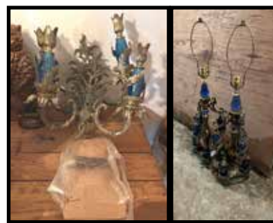
Elegant wall sconce & parlor lamps, 3 piece set, in blue