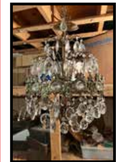
2 Crystal chandeliers