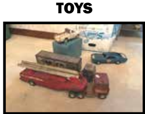
Toy fire truck