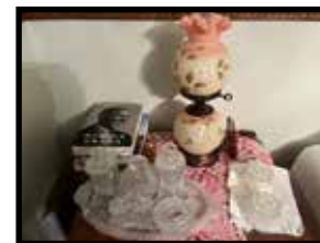
Matching Fenton Glass table lamps