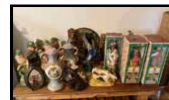
Irish Leprechauns, Western Series, etc.