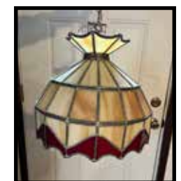
Leaded Slag glass hanging light