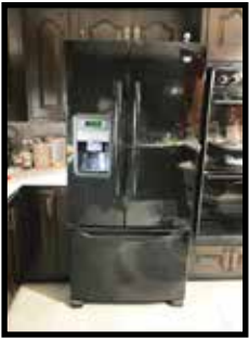
Maytag 2 door side by side refrigerator w/water & ice dispenser (black), like new