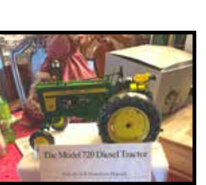
JD Model 720 Diesel tractor precision classic w/box