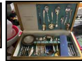
Set Reed & Barton flatware