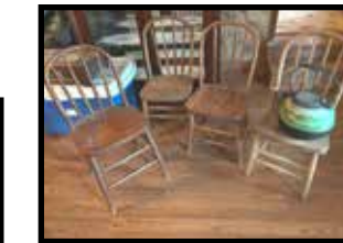
3 child's Bentwood chairs, 1 youth size