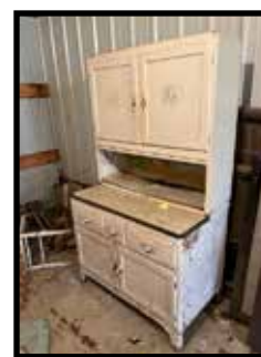
2 1950 Kitchen cabinets, white, 1 sellers