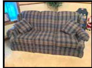
Flex Steel 3 cushion sofa, like new