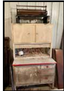
Primitive paper cutter-roller