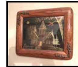
Wire Art church in oak frame, neat piece