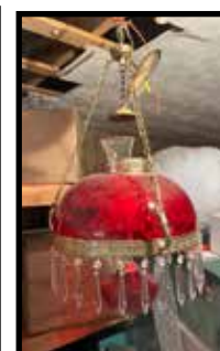
Hanging red globe parlor light