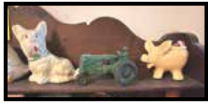
Early cast MM toy tractor