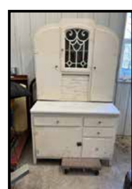
Roll top Hoosier cabinet