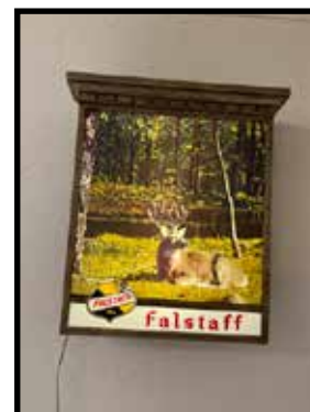
Falstaff beer clock