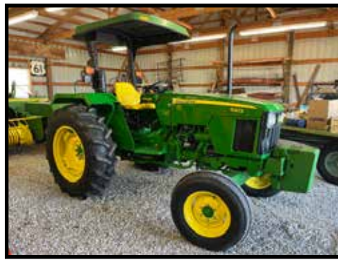
2012 John Deere 5203 diesel tractor, wide front, open station w/canopy, same as new only 598 hours, bought new