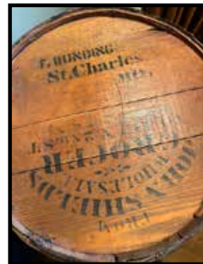
Wooden sugar barrels, F. Bunding