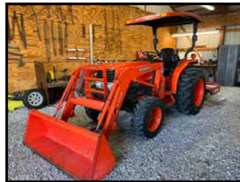
Kubota L3130 diesel tractor GST sells with LA513 hydraulic front end loader, only 687 hours, same as new