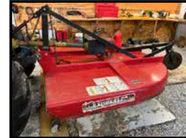
Squealer SQ 720, 3 pt., 6 ft., H/D brush hog, like new