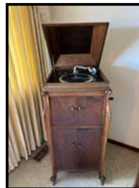
Grand Opry floor model Victrola, excellent condition, Burl walnut cabinet