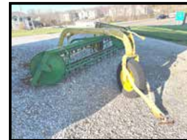
John Deere #64 side delivery hay rake w/dolly wheel