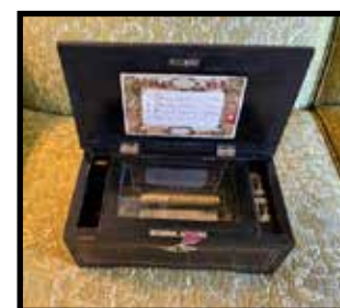
German music box