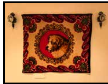
Glass eye buggy lap robe (St. Bernard)