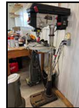
Craftsman laser trac, 1 hp. floor model drill press