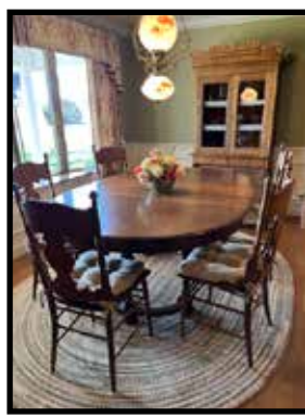
Oak kitchen cabinet, glass doors, nice