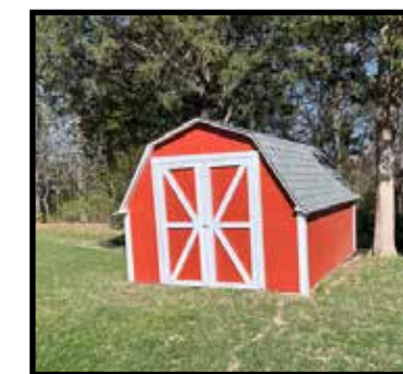
10'x12' Portable (Red Barn) storage building