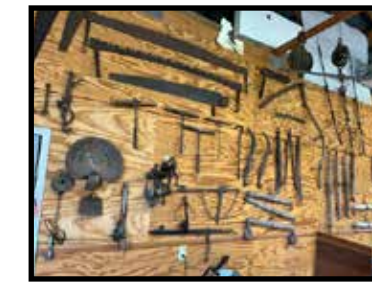
2 man saw