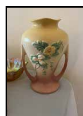
Hull 2 handle vase