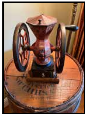
National Specialty stenciled small store type coffee grinder

FROM THE WELDON SPRINGS BUNDING, POSTMASTER, GENERAL MERCHANDISE STORE EST. IN 1872