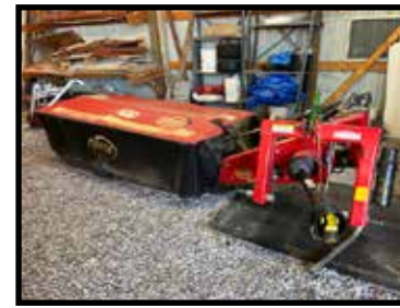
Vicon Extra 122 7'8" 3 pt. disc mower, bought new 3 yrs. old, less than 100 acres, same as new