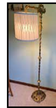
2 Floor lamps