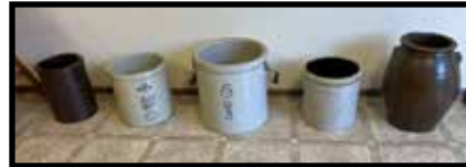
Blue Ribbon 5 gallon 2 handle crock jar