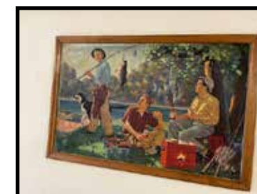
Falstaff fishing advertising