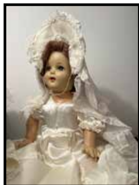
Early bride dolls