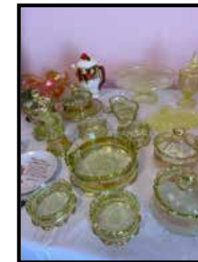
Vaseline glass w/gold band, berry bowl set, cruet, sugar, cake plate, etc.