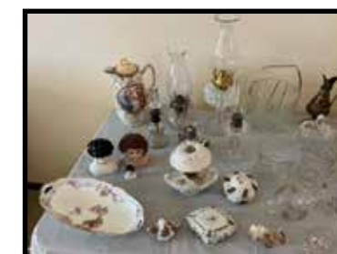
Porcelain doll heads