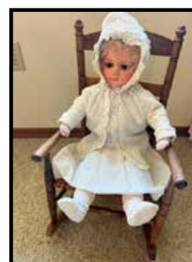
Early doll w/glass eyes