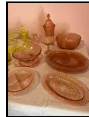
Miss America Pink Depression – plates, bowls, candy, serving piece, etc.