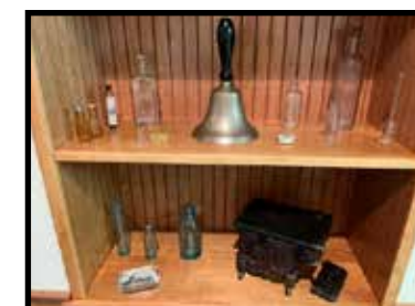
Perfection child's cast iron cook stove