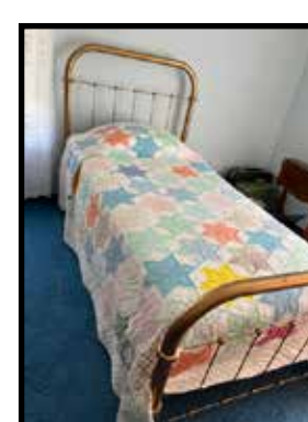
Rod iron single bed