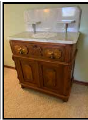
Walnut white marble top dresser w/mirror