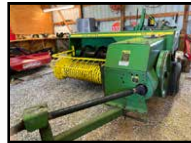
John Deere #336 twine hay baler, extra clean