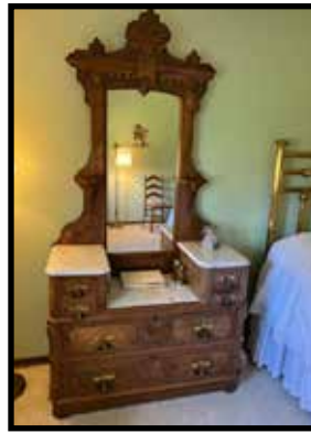
Walnut white marble top dresser & matching washstand, beautiful set