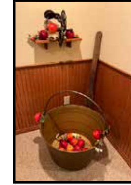
Large brass 30 gallon kettle