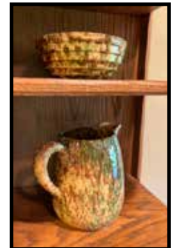
Splatterware crock bowl