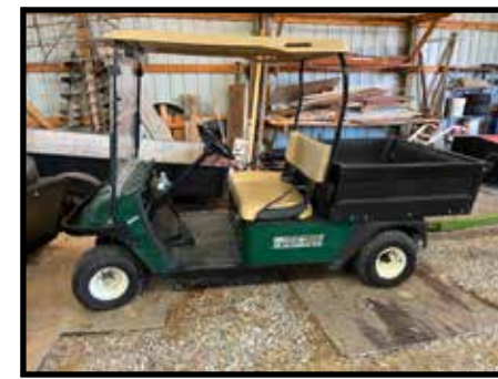
Workhorse EZ Go 200 gas cart w/electric tilt bed, like new