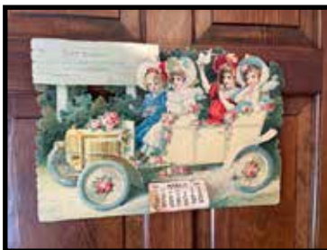
1912 Fred Bunding general merchandise Weldon Springs advertising calendar