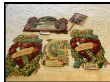
Lot Fred Bunding general store advertising