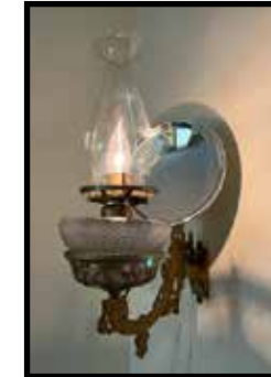
Wall bracket oil lamps