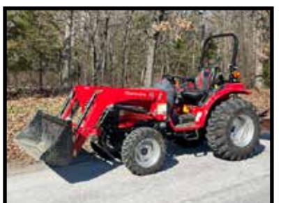
2021 Mahindra 1626 diesel tractor sells with 1626L front end loader, shuttle shift, 4 wheel drive, bought new, only 45 hrs., same as new