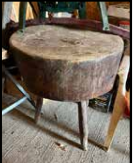
Round butcher block