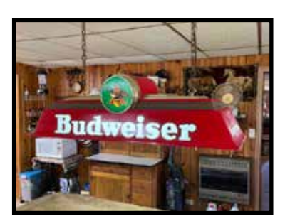
Budweiser pool table light, nice piece

On any item purchased through our auctions, we are not experts on description or authenticity of item, buyers, it is your decision to purchase item as it