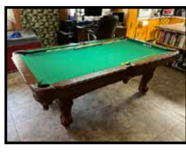
Sportscraft pool table