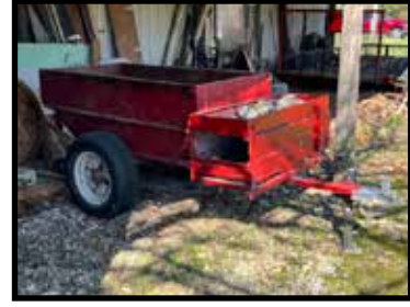
Single axle trailer, set up for cutting & hauling firewood