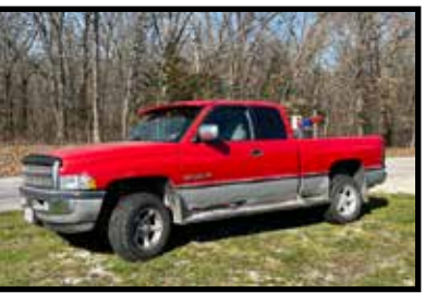
4 wheel drive, automatic (2nd motor), good truck