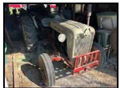
1954 NAA Ford tractor, extra clean