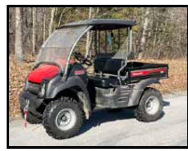
2013 Kawasaki 610 XC mule, gas w/dump bed & winch, only 288.3 hours