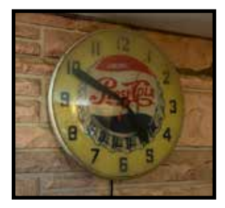
Pepsi-Cola wall clock, out of Hunnewell Lake Restaurant, nice piece