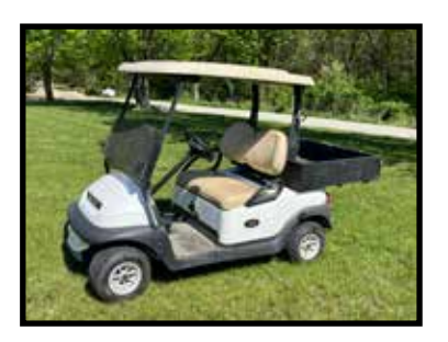
Gas club cart w/utility bed