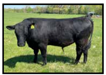
1 Black steer approx. 1300 lbs.