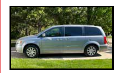
2015 Chrysler Town & Country Touring Van, flex fuel, front wheel drive, serviced every 5,000 miles, runs & drives, 320,xxx miles, extra clean