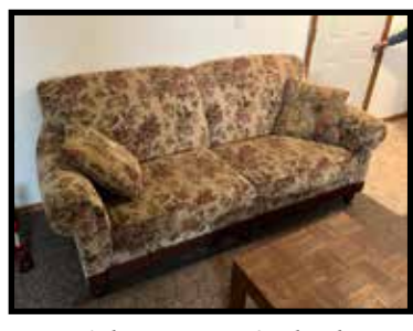
3 love seats, 2 plaid