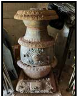
Large Buck #7 pot belly wood stove, Lincoln County store piece