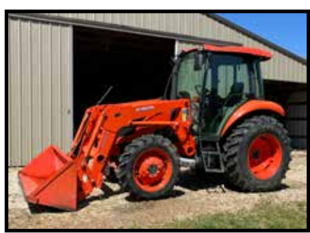
2014 Kubota M6060 diesel tractor, hydrostatic, 4 wheel drive w/ultra grand cab, only 659 hours, 16.9-28 tires, sells with Kubota LA1154 hydraulic front end loader, bought new at Mordt Tractor, extra clean