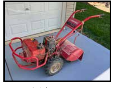
Troy Bilt 8 hp. Horse rear tine garden tiller, extra clean