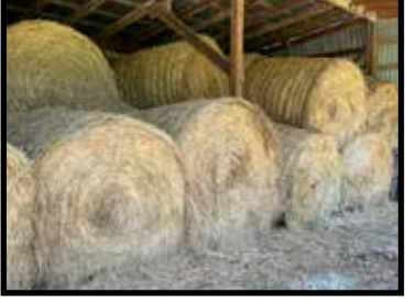
Approx. 28, 4x5 big round hay bales, Brome & Fescue 2023 crop stored inside & off the ground, string tie wrap