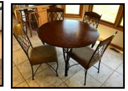
Round top kitchen table & 4 chairs w/leaf