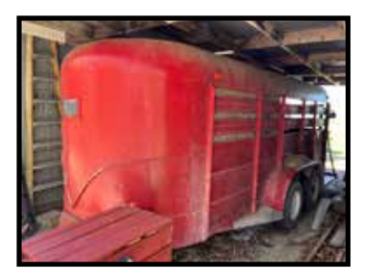
1981 16 ft. stock trailer, bumper hitch, w/middle gate & side walk in door, new floor, kept shedded