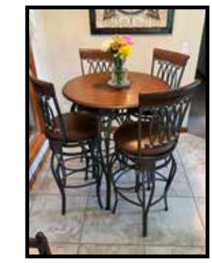
Pub type table w/4 bar stool like chairs, like new