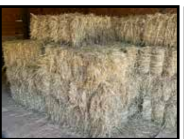
38 small square bales of Brome-Fescue, 2023 crop