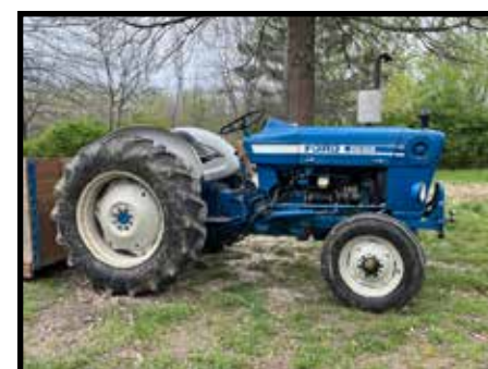
1979 Ford 3600 3 cylinder diesel tractor 45 hp., wide front, 3 pt. w/PTO, power steering, good rubber (State Hwy tractor)