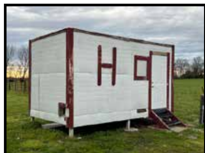
16' long, 9' tall, and 8'4" wide & has nesting boxes