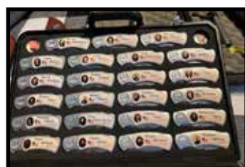
Case of Presidents knives