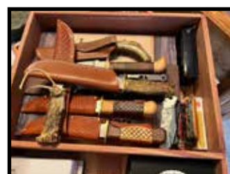
Lot assorted knives