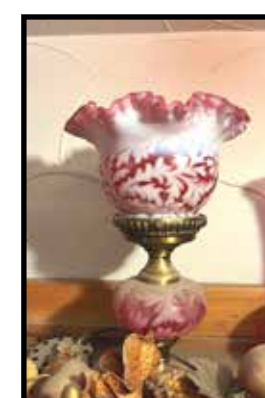
Fenton Glass; Cranberry lamp