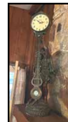
Crosa quartz figural bronze clock