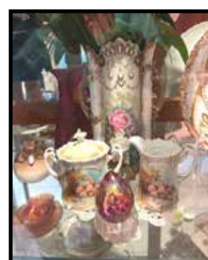
RS Prussia sugar & creamer