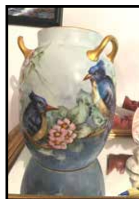
Nippon vases; 1 large 2 handled