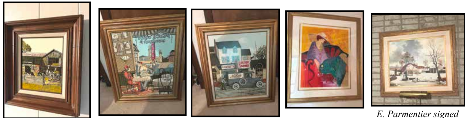
E. Parmentier signed painting in frame