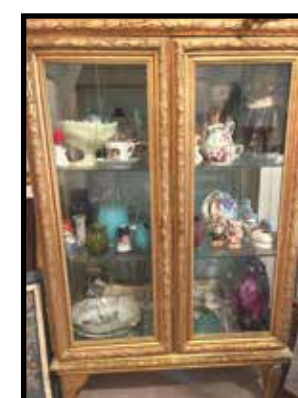
French Provincial gold framed curio