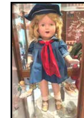
Dolls; 1 Shirley Temple