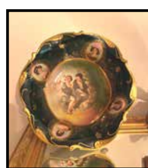
Limoge portrait plate