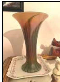
Lundberg Studios Peach Blossom flare vase