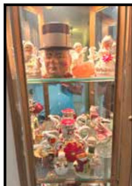
Teapots Russian Verbilki