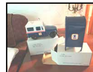
Mailbox & mail truck banks