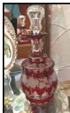
Red etched glass decanter