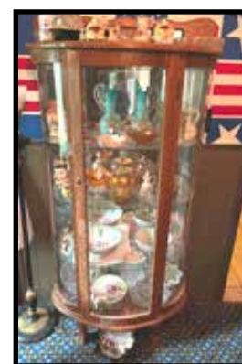
Oak curved glass china cabinet