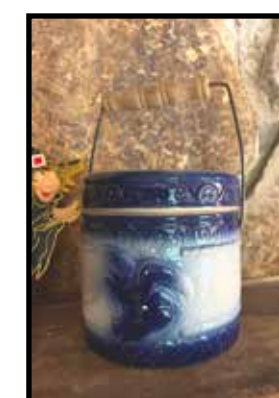
Flow Blue salt crock