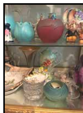
3 pieces of Van Briggle