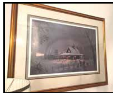
Jesse Barnes; Night Departure #21 of 1000, print in frame