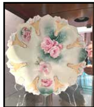
Several RS Prussia large dinner bowls