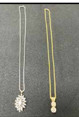
14 Karat two tone two brilliant diamond pendant on Spiga chain featuring a 2.15ct round brilliant cut diamond; M color, and a 1.74ct round brilliant cut diamond; N color appraised at $21,177.00 as of 2025 & 14 Karat white gold 29 diamond ladies marquise shaped cluster pendant on Spiga chain featuring a .50ct round brilliant cut diamond; H color, appraised at $8,313.00 as of 2025