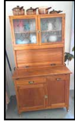
Kitchen cabinet w/flour bin