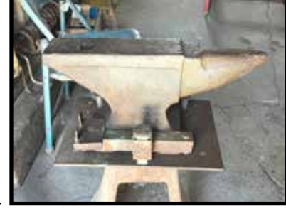
#70 anvil on stand