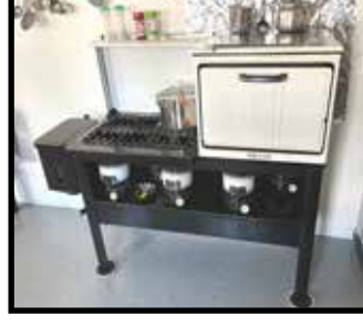
New Perfection 3 burner oil cookstove