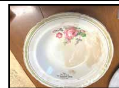
Brown Mercantile Co. Ethlyn, MO 1928 Advertising bowl