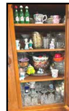
Vess salt & pepper