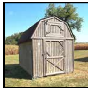
8'x12' portable barn type storage building w/electric (Diamond Built), good building