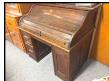
Oak S type rolltop desk