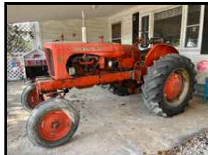
1953 Allis Chalmers WD45 wide front end, snap coupler hitch, runs good

SELL AT 1:00 P.M. 2ND RING (SKID LOADER DAY OF SALE TO LOAD OUT)