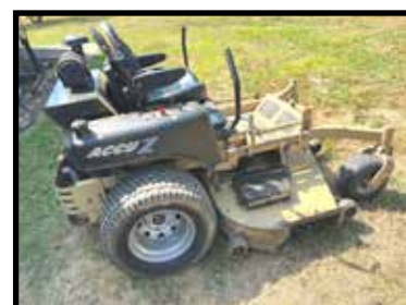
Land Pride Accu Z, Zero-turn 25hp., 6' cut, gas lawn mower, bought new