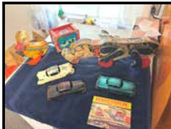
Snoopy pull toy