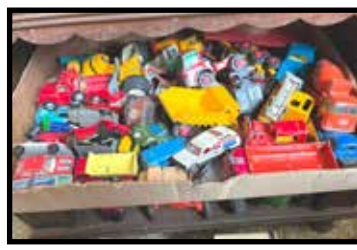
Early 1940s tin cars, trucks, etc