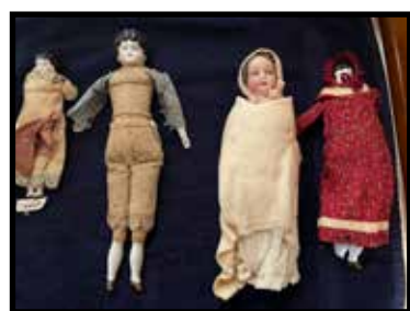
China head dolls (her parents' dolls)