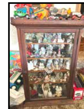
Oak store cabinet (Brown Mercantile Ethlyn piece)