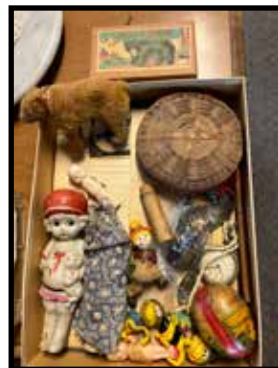
Jolly Bear w/box