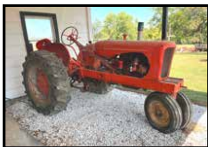
1953 Allis Chalmers WD45 tri front end, runs good