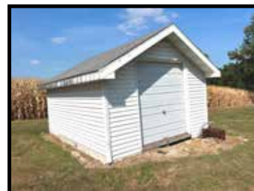
12'x16' portable building on skids w/rollup door, nice building