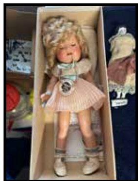
Original Shirley Temple w/box