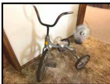
Convert-O tricycle (Never seen one)