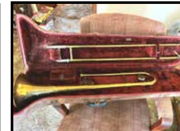
Bundy trombone w/case