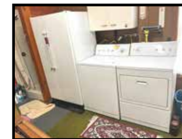
Whirlpool upright deep freeze large box, nice & Kenmore 90 series auto washer & matching LP gas dryer, white, nice