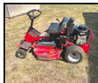
Snapper SR1030, 10hp., 30" cut riding lawn mower, runs good