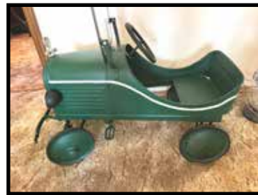
Model T pedal car

PEDAL TRACTORS & CARS SELL AT 11:00 A.M.