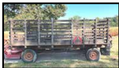
7'x14' flatbed farm wagon w/rail sides, good wagon