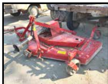
Farm King 72", 3 pt. rear discharge finish mower