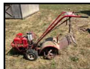
Troy Bilt Pony rear tine tiller