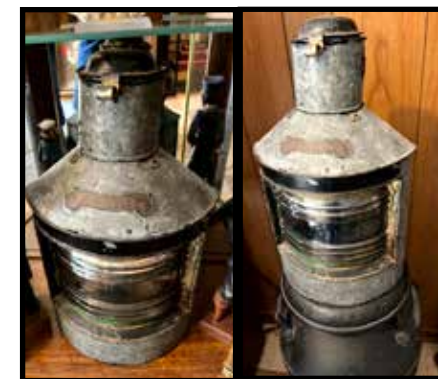
Stuurboord lanterns - Ship lantern Perko - Boat signal