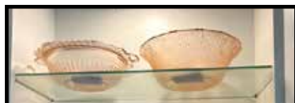
Pink Depression bowls, serving piece