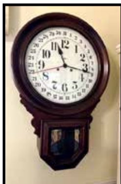
Howard Miller regulator clock