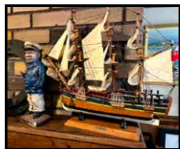
H.M.S. Endeavor model ship