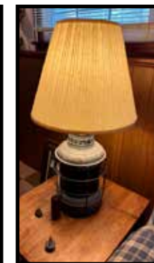
- Ship lantern Geo. B. Carpenter Co. - 2 ship lantern lamps - Perkins Marine boat signal