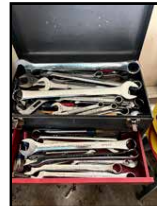
Craftsman wrenches; 1 1/4", 1 1/8" & down, open end box wrenches