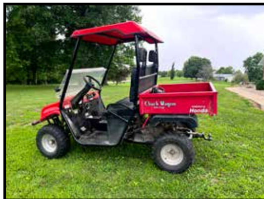
Chuck Wagon 340cc, 11 hp gas powered by Honda, positive traction w/manual dump bed, bought new