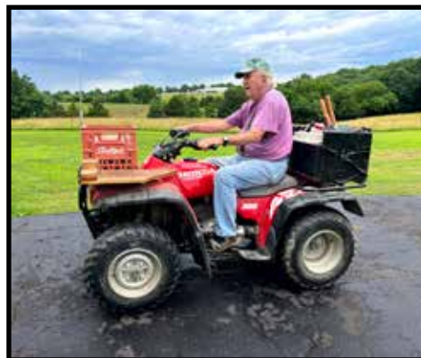
Honda 300 4x4 4 wheeler, bought new, adult driven