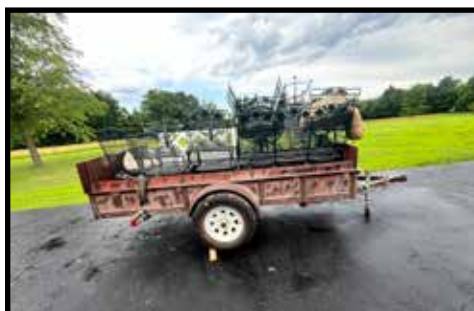
66" w x 10' single axle trailer, ball hitch w/sides, winch & dump bed, with title