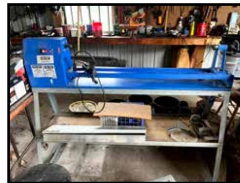
Pro Tech 1000 m/m wood lathe, floor model w/accessories, 38", 4 speed, 7" height