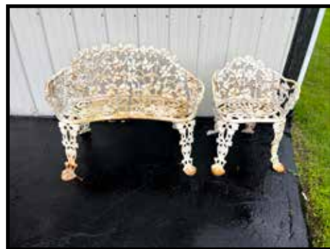
Cast patio bench & chair