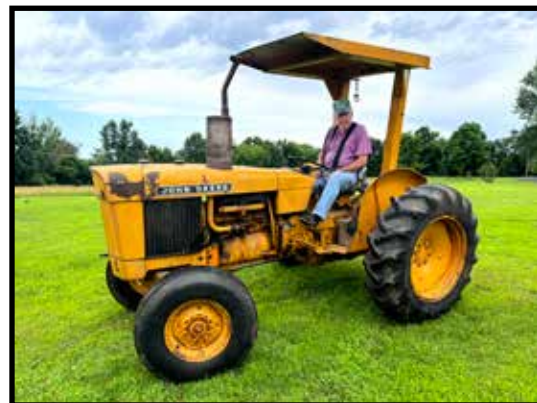
John Deere 400 gas tractor (yellow), wide front end, Hi low trans, 3 pt., PTO, power steering, with canopy, shows 1,018 hours