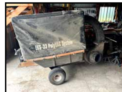
LVS-33 Poly Vac system trailer type 9 hp. Leaf vac